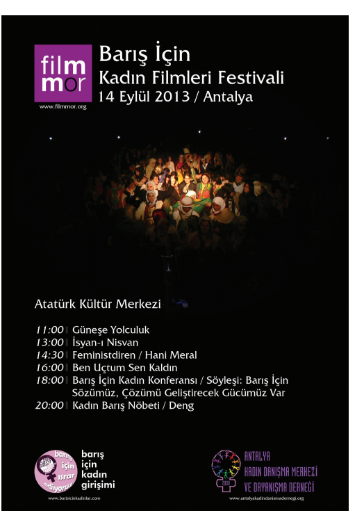
Antalya Women's Films for Peace Film Festival

In line with the decisions it reached in its conference, WFPI conducted meetings