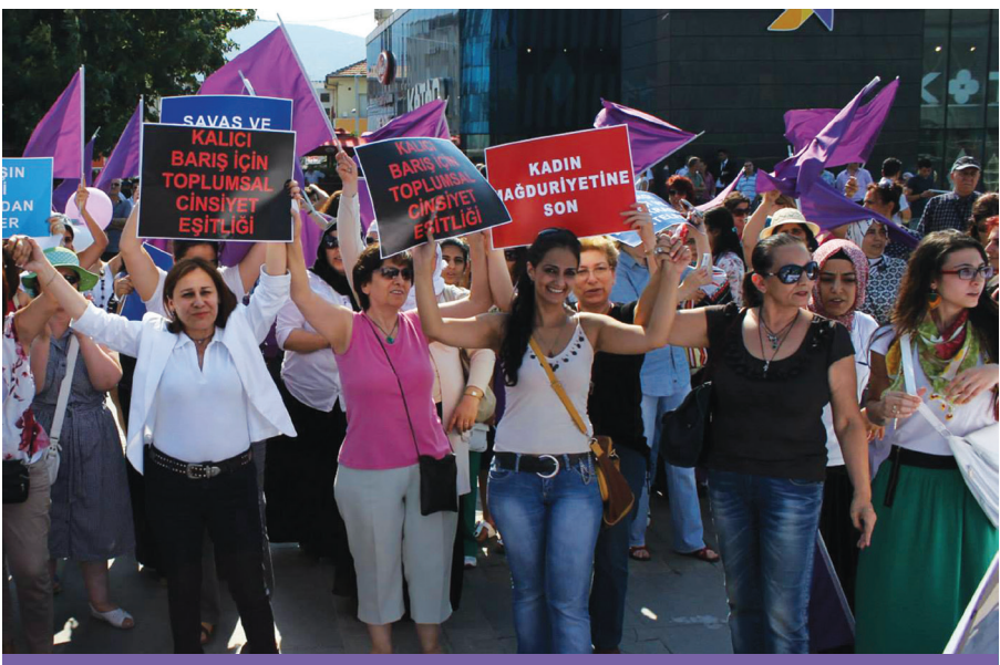
Bursa WFPI - 'We Are Marching for Equality, Freedom, and Peace'

Many peace processes around the world have spread into society, have become popularized and therefore progressed due to structures set up by women. As of today, it can be seen that no transparent or legalized negotations are taking place in Turkey. Transparent and legalized negotiations are crucial for the continuation of this process. However, even a negotiation process of this kind does not carry any guarantee that women's problems shall be taken into account.