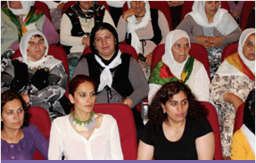
Adana WFPI – "Women Are Talking About Peace"

As of the present, no mechanisms or bodies have been set up in order to ensure the participation of women in the process of resolution currently taking place in Turkey. Therefore, in the conference held on May 4, 2013, women's expectations from the process of resolution were discussed, and the decision made was that women would take it upon themselves to create the necessary pathways for their active participation in the process of resolution. In line with this, five separate commissions were established within BİKG. These are: the Women's Truths Commission that is to expose the various dimensions of what women have suffered due to the war; the Gender Equality and Constitution Commission that is to ensure gender equality and discuss legal regulations that shall aim to compensate for the damages women have suffered due to the war; the Security Reform Commission that