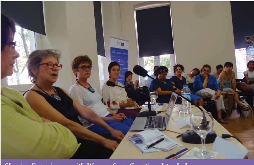
Sharing Experiences with Women from Croatia - Istanbul

organizations. With this report, WFPI invites the state of Turkey to immediately create a national plan that places women at its centre, and put into effect regulations that will ensure the equal participation of women in the peace-building process. In the meantime the WFPI report also demonstrates the need for the transparency and popularization of the peace process; in other words, it lays out the necessity of building due mechanisms which will enable the society to participate in the shaping of the peace and resolution, bringing this peace into the society itself. It claims that if this is not done peace will not be lasting or sustainable. This call by WFPI is also in accordance with the resolutions of international organizations that Turkey is a part of, and especially with United Nations resolutions.