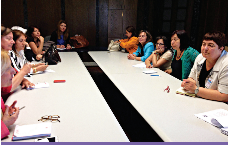
Meeting with Women Members of Parliament in the Grand National Assembly of Turkey

On the other hand, examples from all across the world show that peace processes can be carried out in a healthy manner, and become sustainable only and only if the participation and support of the society is ensured. If