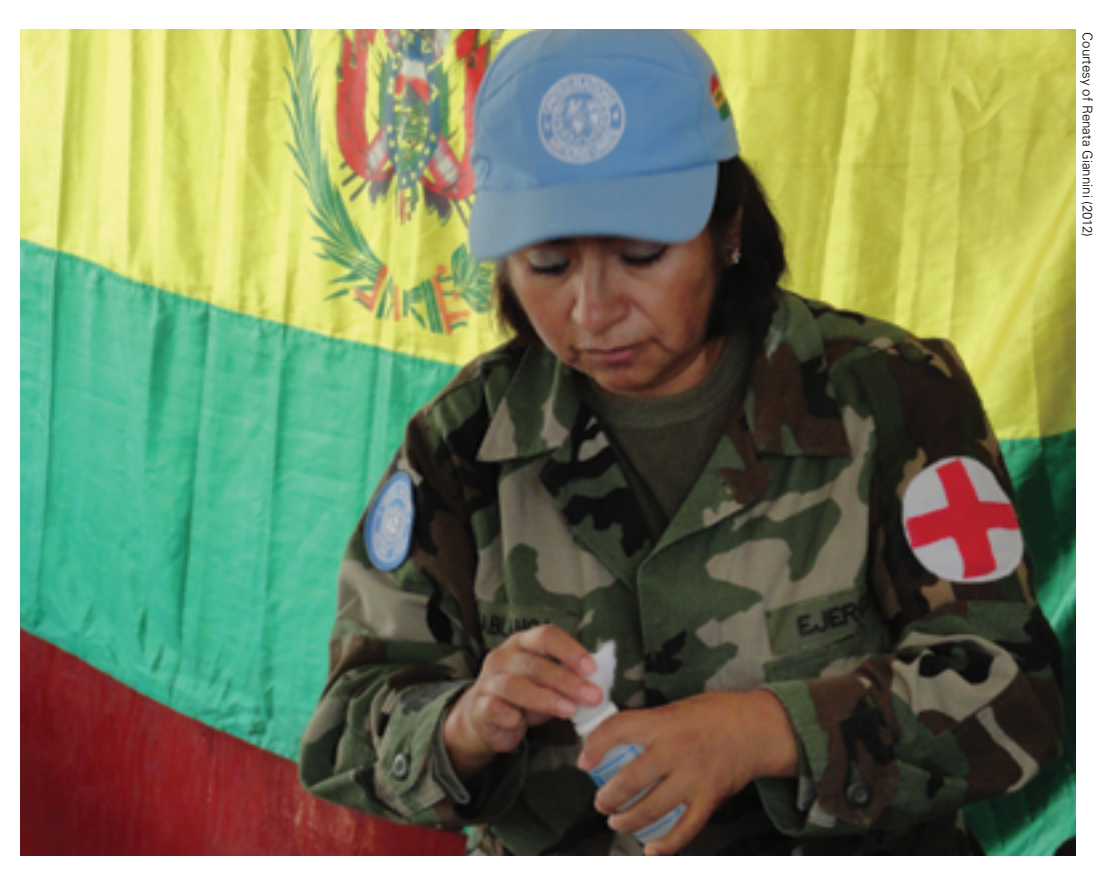
Bolivian peacekeeper providing medical and dental support for internally displaced persons in Cité Soleil, Haiti.

As outlined above, the limited participation of Brazilian military women in peace operations is a direct result of their limited presence in the country's Armed Forces. At the same time, Brazil has been increasing its efforts to enhance women's participation in different levels of decisionmaking processes in peace-keeping operations, and this is likely to have a positive impact in the country's gender balance in the field. The participation approach can be