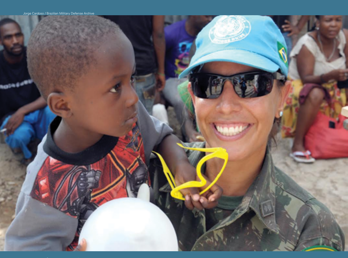
Brazilian female peacekeeper in Haiti