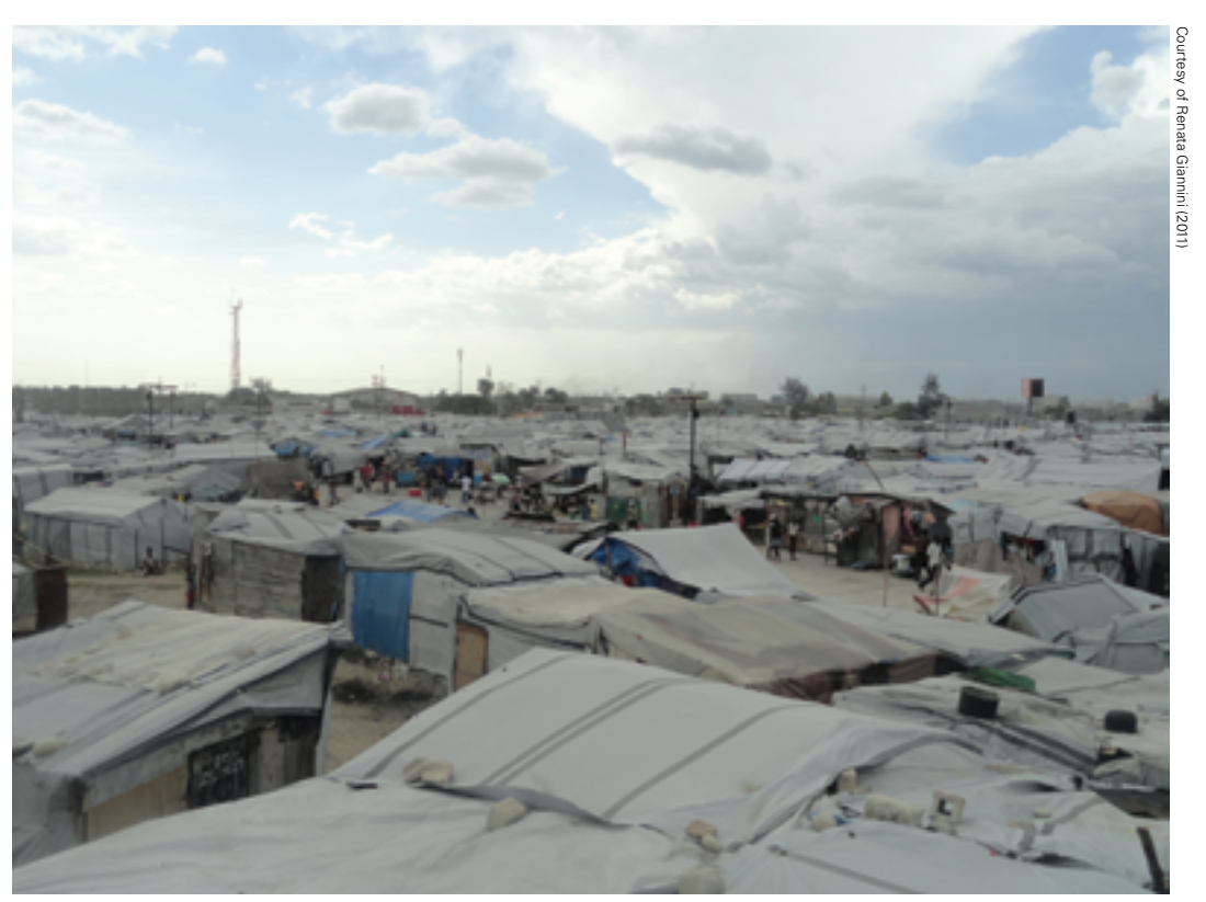
Jean Marie Vincent IDP camp, where Brazilian troops often carried out patrols.

Interviews with military women in the field indicated that overall they perceive a positive impact from their presence in Haiti. For example, interviewees of different nationalities