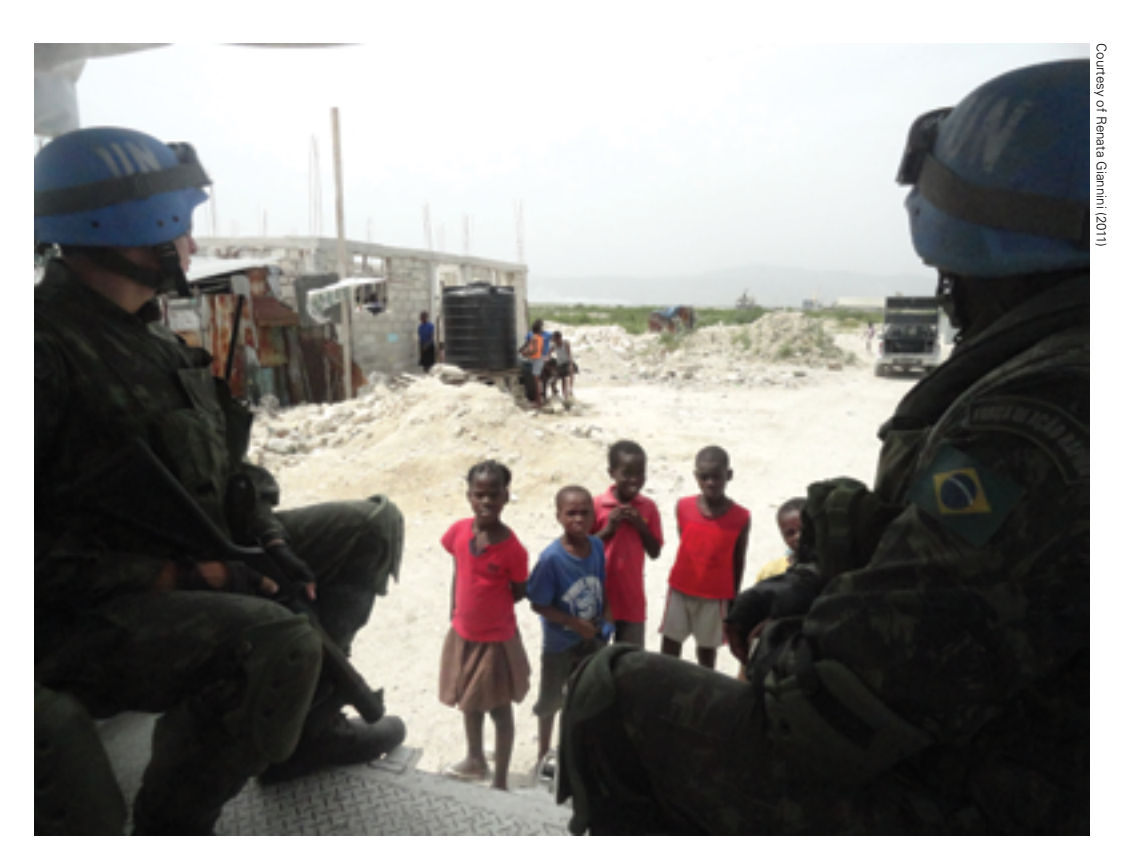
Brazilian soldiers of the MINUSTAH peacekeeping contingent on a routine patrol in Cité Soleil, Haiti.

The creation of a multi-sector Gender Commission at the Ministry of Defense could prove central to the advancement of the women, peace, and security agenda in Brazil, especially within the military. The Commission was created in September 2014, with a reasonably well defined mandate and membership. According to the normative document that launched it, the body has a consultative and not deliberative mandate. Its purpose is to incorporate a gender perspective in the formulation and execution of public policies within the Ministry of Defense's areas of work. Its membership configuration includes almost all