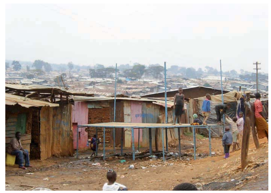
Kibera slum where hundreds of thousands of women live in poverty

"Women are still grossly denied the right to adequate housing and related rights such as land and water," said Miloon Kothari, former Special Rapporteur on Adequate Housing at the UN Commission on Human Rights. "We live in a world today where millions of women are homeless and landless."