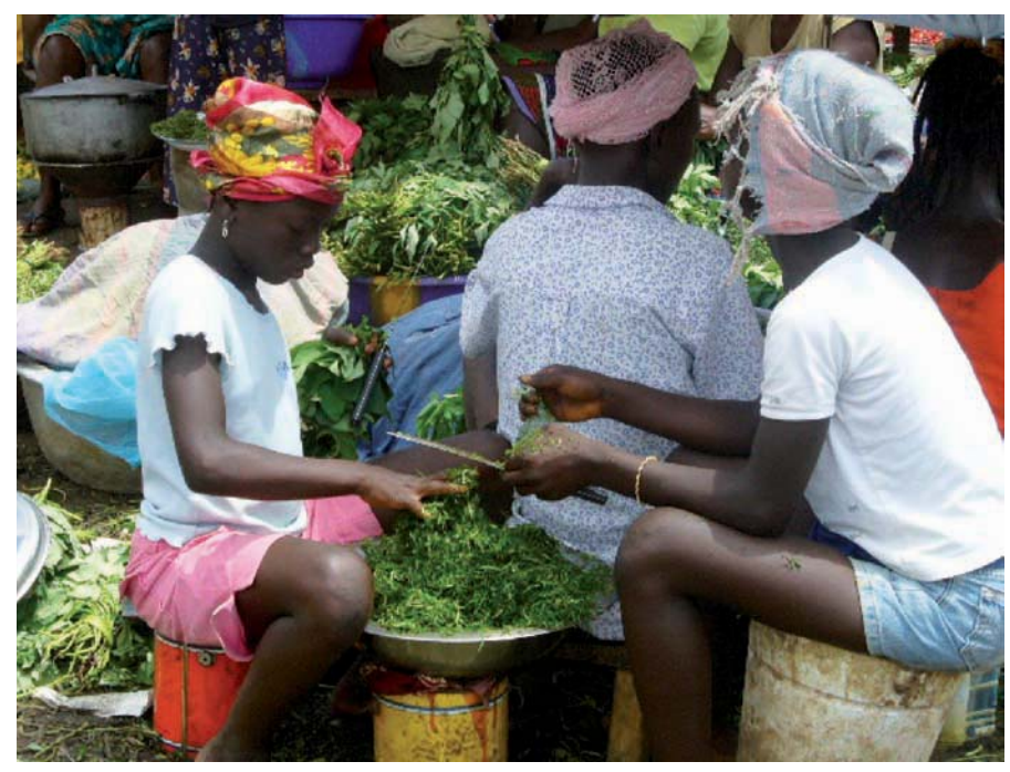
Women are at greater risk of losing their livelihoods as the recession bites

In its recent report, Averting a Human Crisis During the Global Downturn, the World Bank