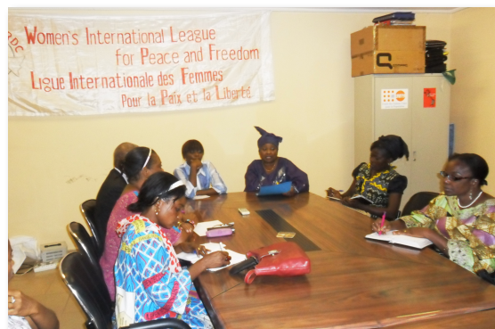
WILPF DRC (Democratic Republic of Congo)