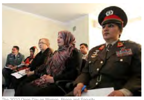
The 2010 Open Day on Women, Peace and Security. Afghanistan, 2010