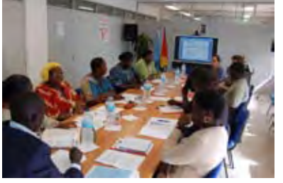
The 2010 Open Day on Women, Peace and Security. Guinea-Bissau, 2010