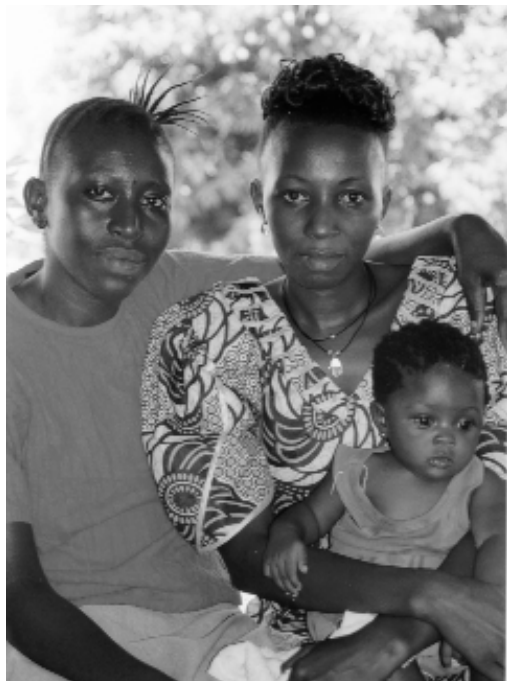
Despite serving with the fighting forces during the war, many girls and women have been left out of DDR services because they were considered non-combatants.

Despite their distinct experiences within the fighting forces, no comprehensive programs existed to help girls and women make considered decisions about their “AK-47 marriages.” Apart from a handful of micro-credit schemes targeted at women serving with the fighting forces, no comprehensive approach or