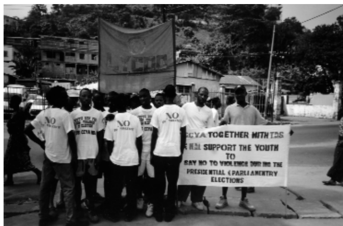
Young people want to move beyond marginalization to real participation in society. Here they came together to support non-violence among youth during the May 2002 presidential and parliamentary elections.

The consequences of this exploitation are deep and