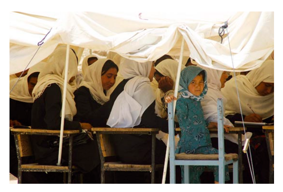
Girls' school in Afghanistan.