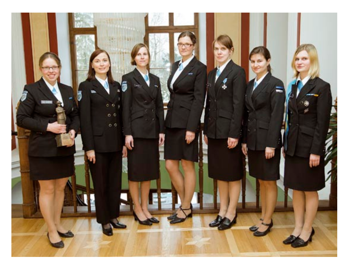
Members of the Estonian women's voluntary defence organization at the awarding ceremony of 2011.