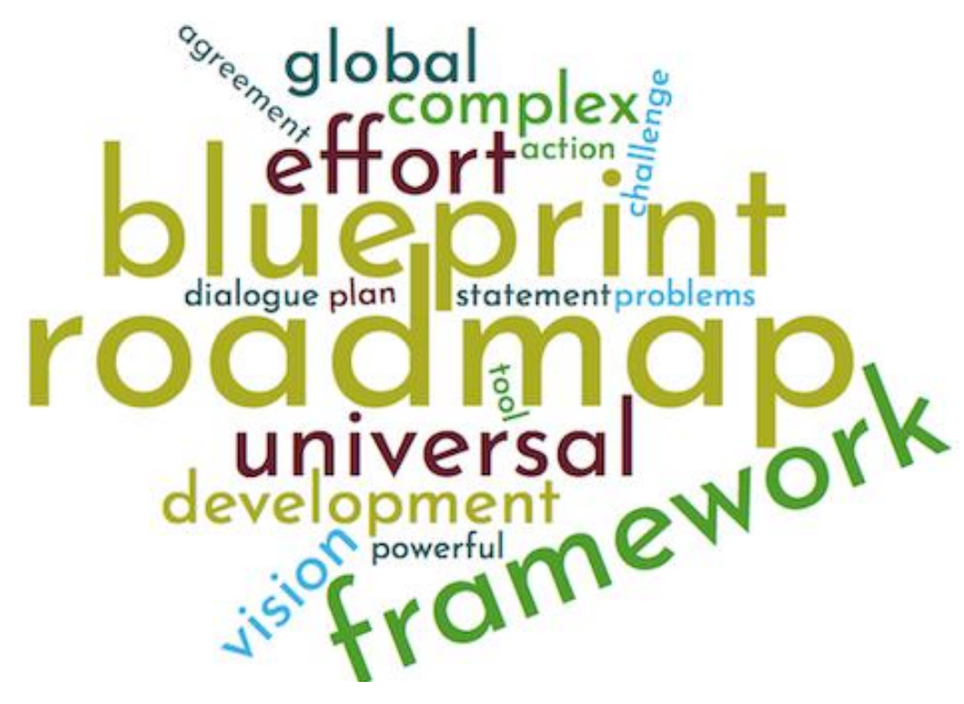
Image 1: Word cloud highlighting the words used in the statements to refer to the 2030 Agenda. The size of the word correlates to the number of repetitions.

From the statements that refer to the 2030 Agenda or to the SDGs, 37 countries (25%) describe them as a 'roadmap, blueprint or framework' (Table 1) "to bring happiness to the people and leave no one behind in the path to sustainable development" (Cabo Verde), achieve the personal development of every person in the planet (Nepal), to create sustainable and resilient futures (Samoa), or to merely ensure the survival of the human species, in a world that is constantly deteriorating due to business as usual (Zimbabwe). Moreover, Croatia and Nauru pointed out the universality of the Agenda, expressing that problems such as climate change, forced migration and refugee crises, need global solutions.