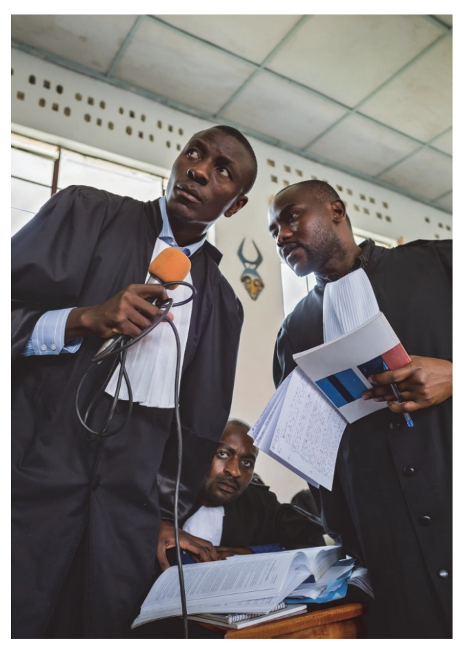
Defense lawyers listen to testimony during the Minova rape trial.

None of the defendants in the Minova case had access to a lawyer during investigations, including when they were formally interrogated. This was contrary to article 19 of the Congolese Constitution, which states that an accused person should have access to legal assistance at all stages of the criminal proceedings.90 The defense lawyers noted that this created difficulties and contradictions later during the trial.91