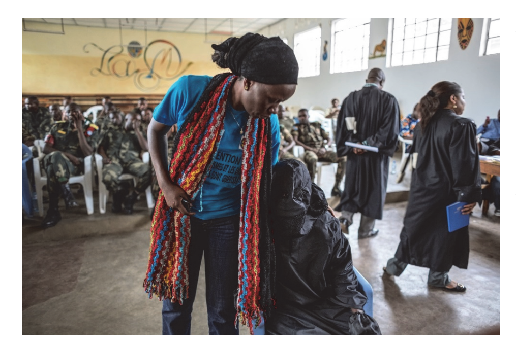
A psychologist comforts a woman before she testifies about having been raped at the Minova trial.

While the long-term solution is to strengthen Congo's prison system, it is important in the short term to set up an alert mechanism at the prison in Goma so that any relevant escape could be immediately reported and measures taken to protect anyone at risk. A national specialized protection program, which could be created with the assistance of MONUSCO, could assume protection responsibilities in international crimes cases.