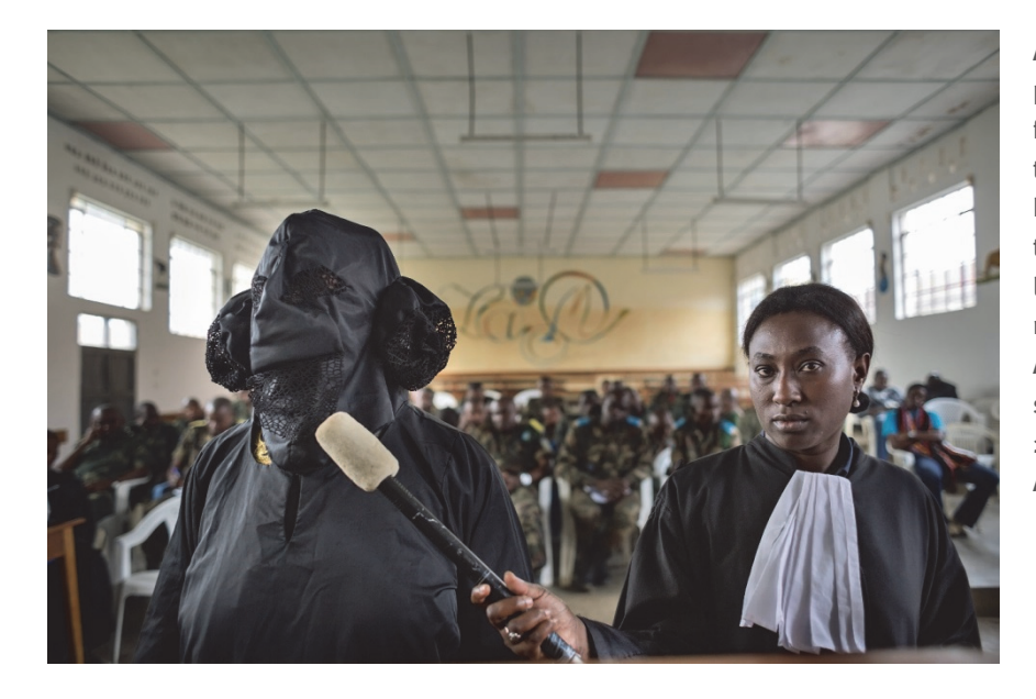
A woman —veiled to protect her identity from the public—testifies about having been raped at the Minova trial. A lawyer holds the microphone for her. Accused soldiers are seated in the rear.

According to the military justice staff that Human Rights Watch interviewed for this report, they did not experience threats or intimidation from soldiers and officers in this case<sup>171</sup>— often a challenge in cases involving the army.<sup>172</sup> Preventative protection measures to ensure the security of victims and witnesses were taken at the investigative phase. For example, in late January 2013, ahead of an upcoming investigative trip by military justice officials, two international organizations, the American Bar Association and Avocats sans Frontières (ASF), and the protection unit of MONUSCO conducted a protection evaluation mission in Minova.<sup>173</sup> MONUSCO's protection unit also conducted protection trainings for all participants in the trial.<sup>174</sup>