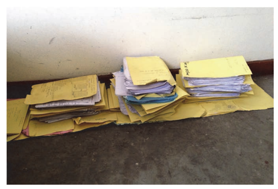
Only one paper copy of the Minova case file exists, pictured here on the floor at the Operational Military Court.

Supporting monitoring activities by non-governmental organizations and the media could also help strengthen the quality and independence of national proceedings. For example, in the Minova case, a local NGO trial monitor said: "The judges knew they were under scrutiny, from us and from the international community; this put pressure on them to conduct good proceedings."<sup>292</sup>