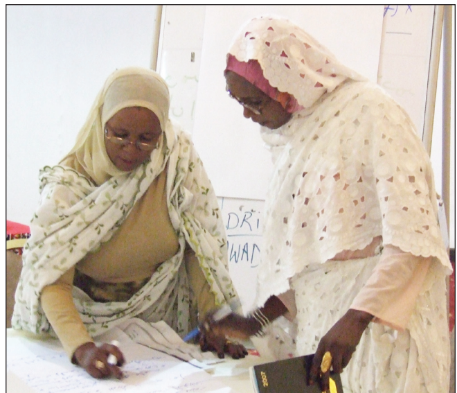
Sudanese participants in Inclusive Security's September 2007 consultation discuss women's priorities for the approaching negotiations.

The consultation was structured to build connections among participants. It began with personal introductions by each participant and then discussion of the importance of women in negotiations; once again, video clips were used to enliven the exchange. A discussion of the value of coalitions followed, as did a simulated negotiation and a presentation of alternate negotiating structures from around the world. The next day focused on participant creation of consensus priorities and the development of negotiating structures that could be used by the international community to create more-inclusive talks. The consultation concluded with an advocacy dinner during