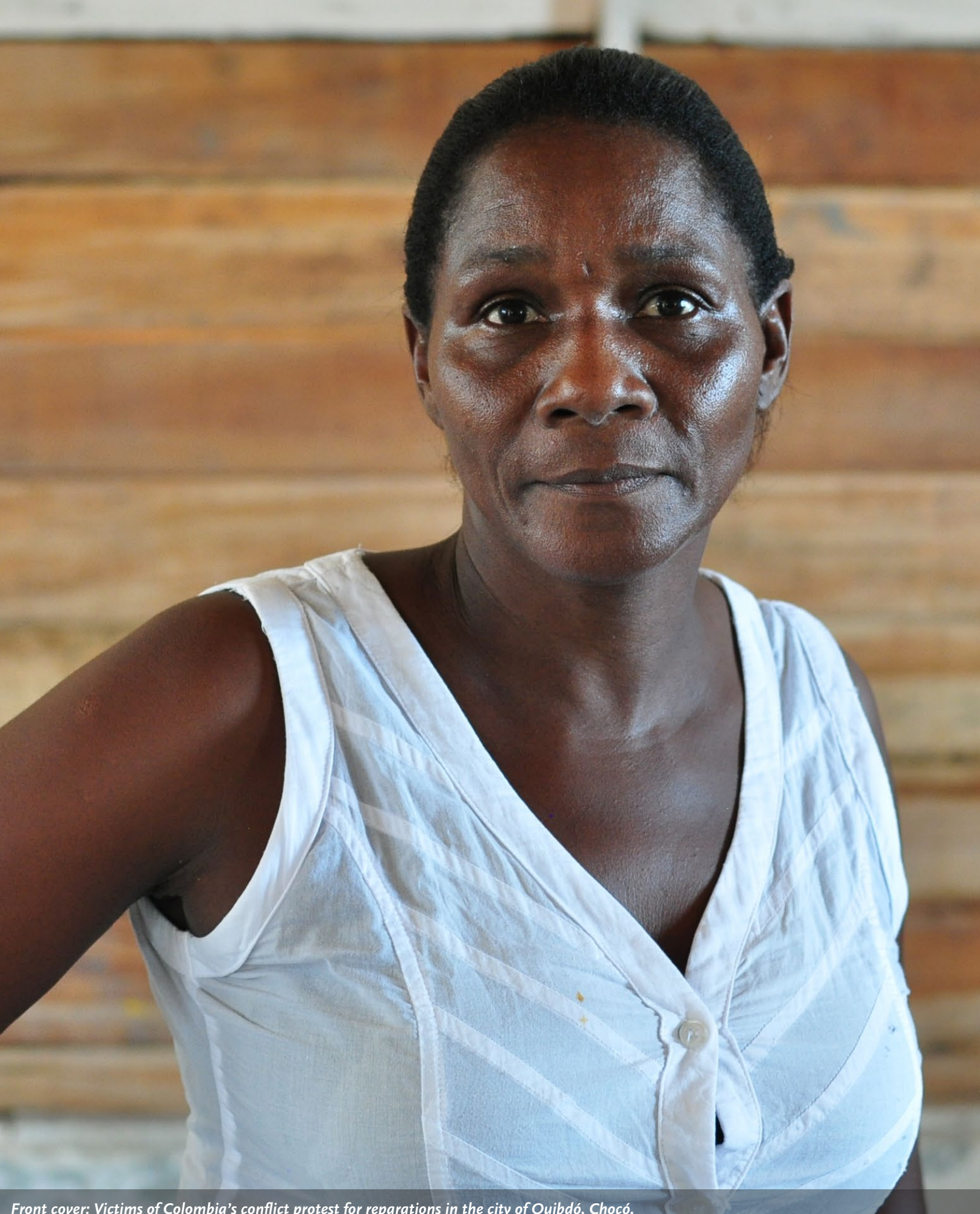
Front cover: Victims of Colombia's conflict protest for reparations in the city of Quibdó, Chocó. This page: This woman and her entire riverside community in the Deparment of Chocó are demanding collective reparations for being displaced by the conflict.