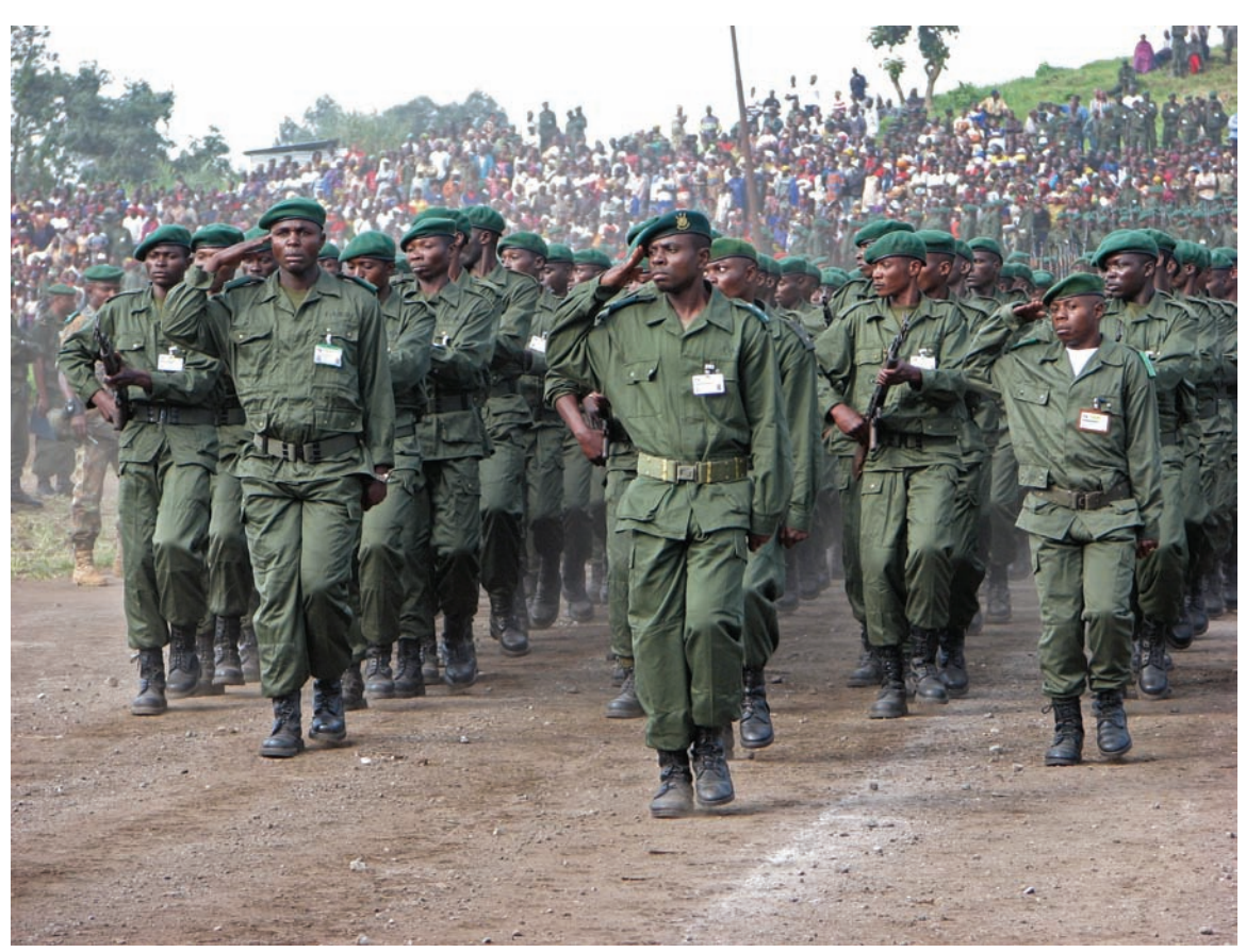
Soldiers of the then-newly integrated 14th Brigade of the FARDC at their unit's passing-out parade at the Rumangabo military base in North Kivu on September 15, 2006. Human Rights Watch does not intend or make any representation that the soldiers depicted in the above photo are responsible for the crimes discussed in this report.

of command. In the words of one disillusioned former 14<sup>th</sup> brigade member, Colonel Rugayi "put his own people in positions of power."<sup>49</sup>