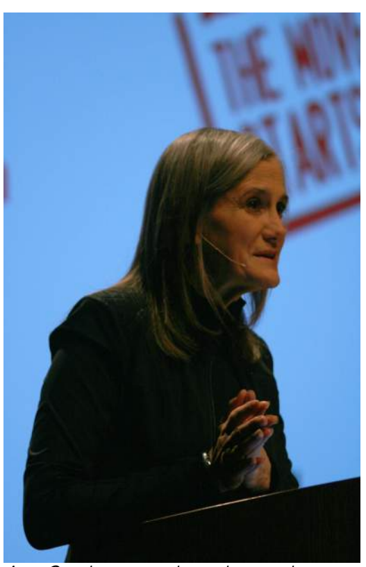
Amy Goodman on independent media