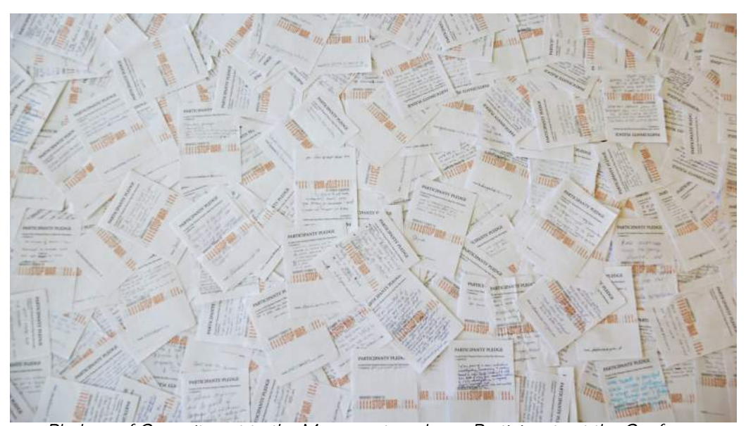
Pledges of Commitment to the Movement made my Participants at the Conference

The three-day conference included five plenary sessions 48 breakout sessions, a manifestation, a marketplace, an anniversary festival, as well as a number of exhibitions, all telling and showing the history of WILPF. Elements from all of these discussions are captured in this overall outcome document, which is organised into two main sections to reflect some of the broad themes covered by the conference. The first explores and challenges root causes of conflict and gendered power in the world, including patriarchy, capitalism, racism, and militarism. The second focuses on strengthening the social movement for peace through concrete commitments for action.