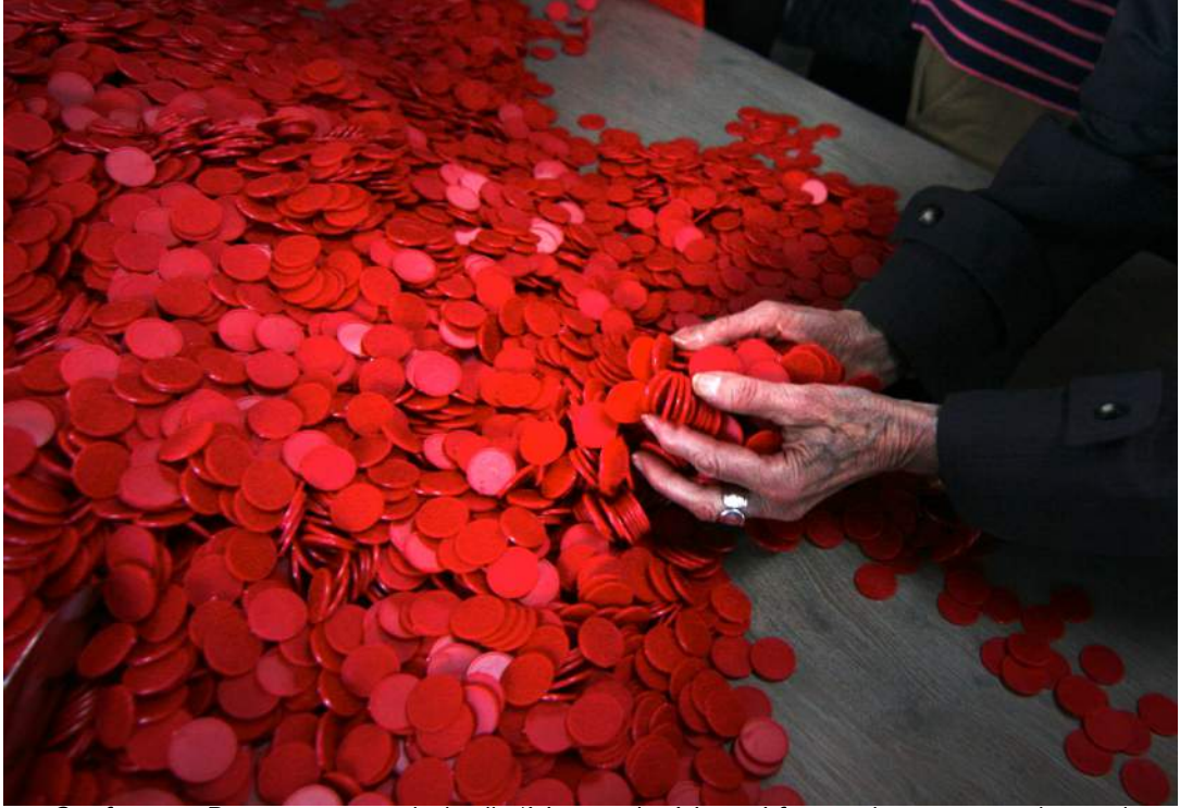
Conference Participants symbolically 'Moving the Money' from military to social spending

In 1915 the women gathered in The Hague saw "in the private profits accruing from the great armament factories a powerful hindrance to the abolition of war." 100 years later we can see that as long as war is profitable, the killing will continue. Those profiting from the production of arms maintain the system of war. They have turned militarism into a way of thinking about, responding to, and investing in the world. The default response to challenges has become military intervention. International law has been subordinated and the UN marginalised.