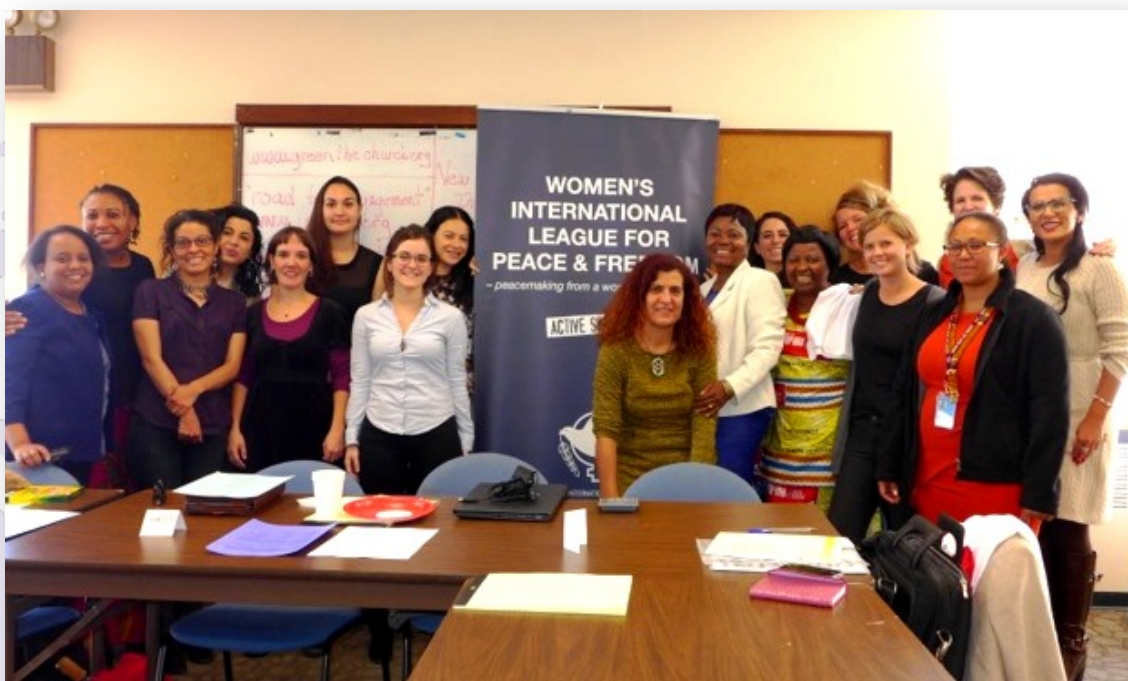
WILPF Workshop: Mobilising Women; Localising Peace

Participants agreed that they would continue to work together to mobilise across movements for a transformative feminist peace agenda.