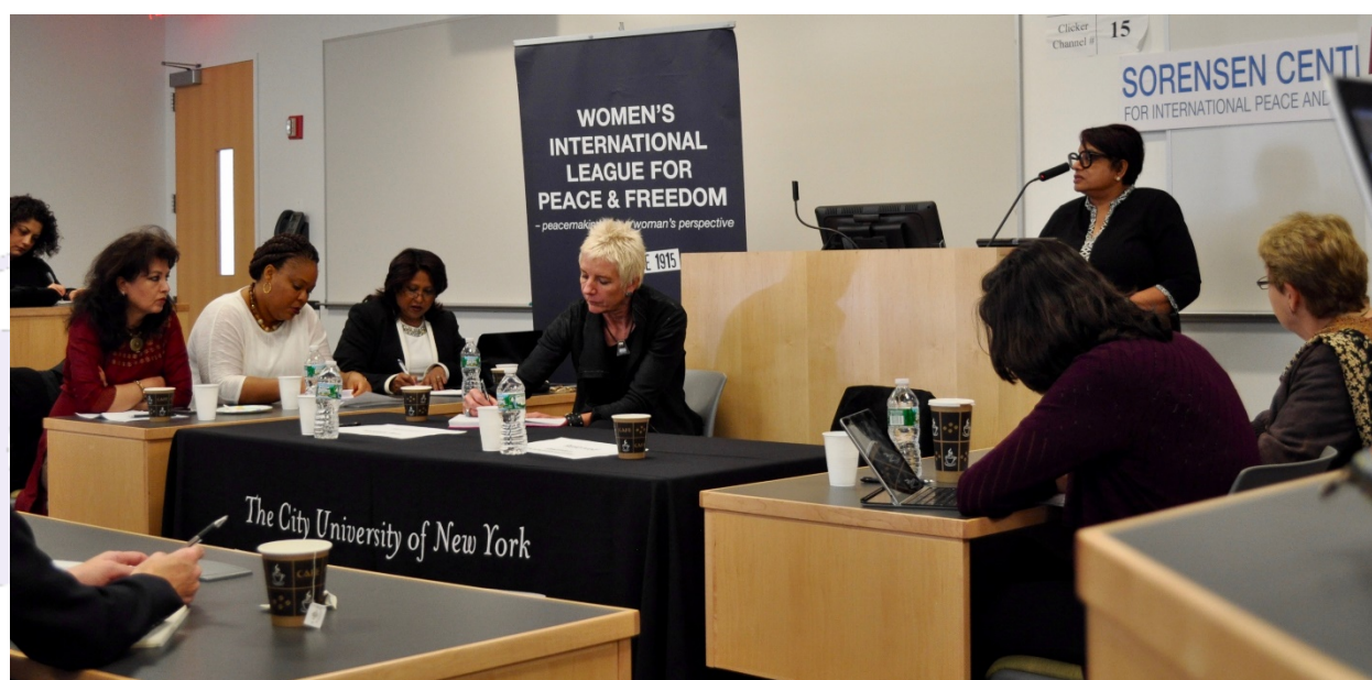
WILPF/MADRE: A Conversation with Radhika Coomaraswamy

Nobel Peace Laureate Leymah Gbowee emphasised the interrelationship between justice and women’s participation. “Wars are fought today on the bodies of women - they can no longer be excluded from participating,” she held. “When women are left out of the first stage of peace and rebuilding, it becomes impossible for them to have access to justice.” Panellists stressed that prosecutions are still very few; there is still a need for systems that will punish perpetrators, provide reparations to survivors, and address systemic challenges to lack of justice at the national level.