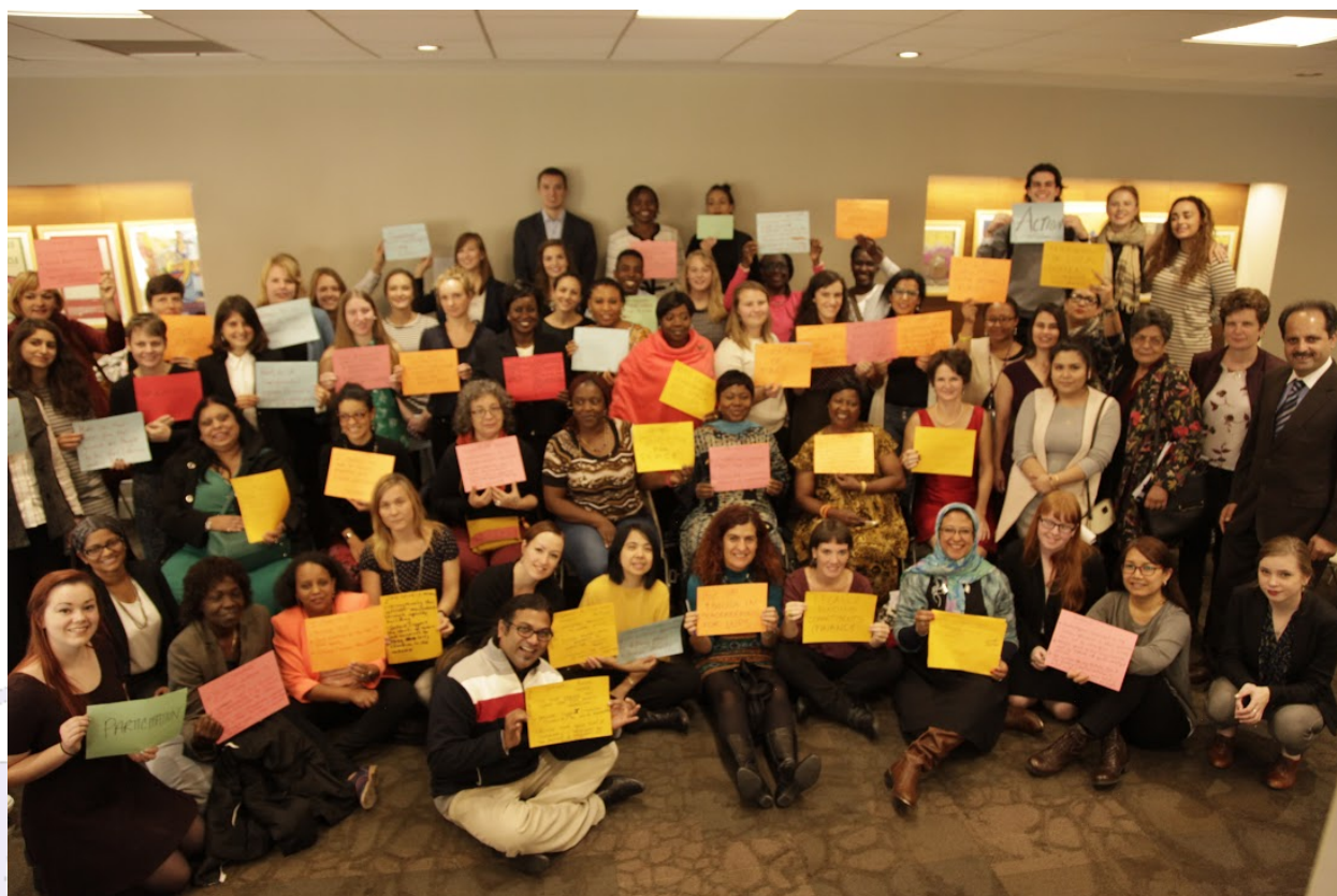
Call to action from the Prelude to the Peace Forum

“how to legitimize women as agents of action.” The group called for governments strengthen international and national action on human rights and humanitarian law including on CEDAW and the Rome Statute, and to work with women’s movements to ensure any action taken on violent extremism does not further put at risk or marginalise communities. Participants committed to leveraging international commitments for accountability, building collaboration with media, and continuing to take action to overturn obstacles to women’s local leadership across movements for peace and gender justice.