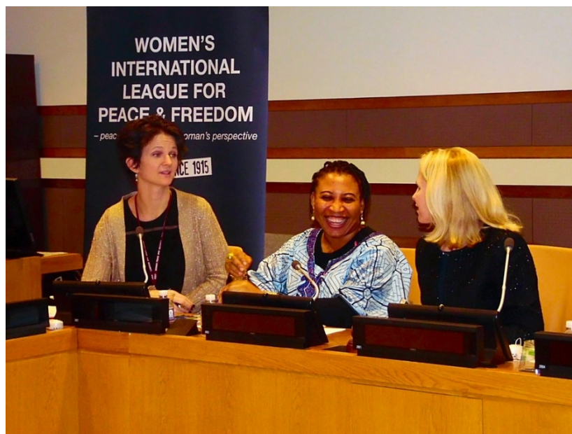
Lecture series panelists before the event

successfully brought attention to. The Security Council alone is not enough. The agenda must be integrated more broadly across the UN, including in the Sustainable Development Goals / 2030 Agenda through Goal 5 and Goal 16, and the 2016 World Humanitarian Summit. Funding and political will are also critical. Frick called for WPS champions at all levels, including the Security Council, the UN Secretariat, and the field, and called for global military spending to be reallocated to conflict prevention.