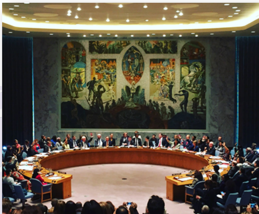
Photo of the Security Council's Vote on UNSCR 2242

On Tuesday (13 October 2015), under the Spanish presidency of Prime Minister Rajoy, the Security Council held the annual Ministerial-level Open Debate on Women, Peace, and Security (WPS). The Open Debate marked the 15th anniversary of the Women, Peace and Security Agenda and the adoption of UNSCR1325 (2000), resolution that, for the first time, acknowledged the strong impact that conflicts have on women and the necessity of including women in peace processes, addressing