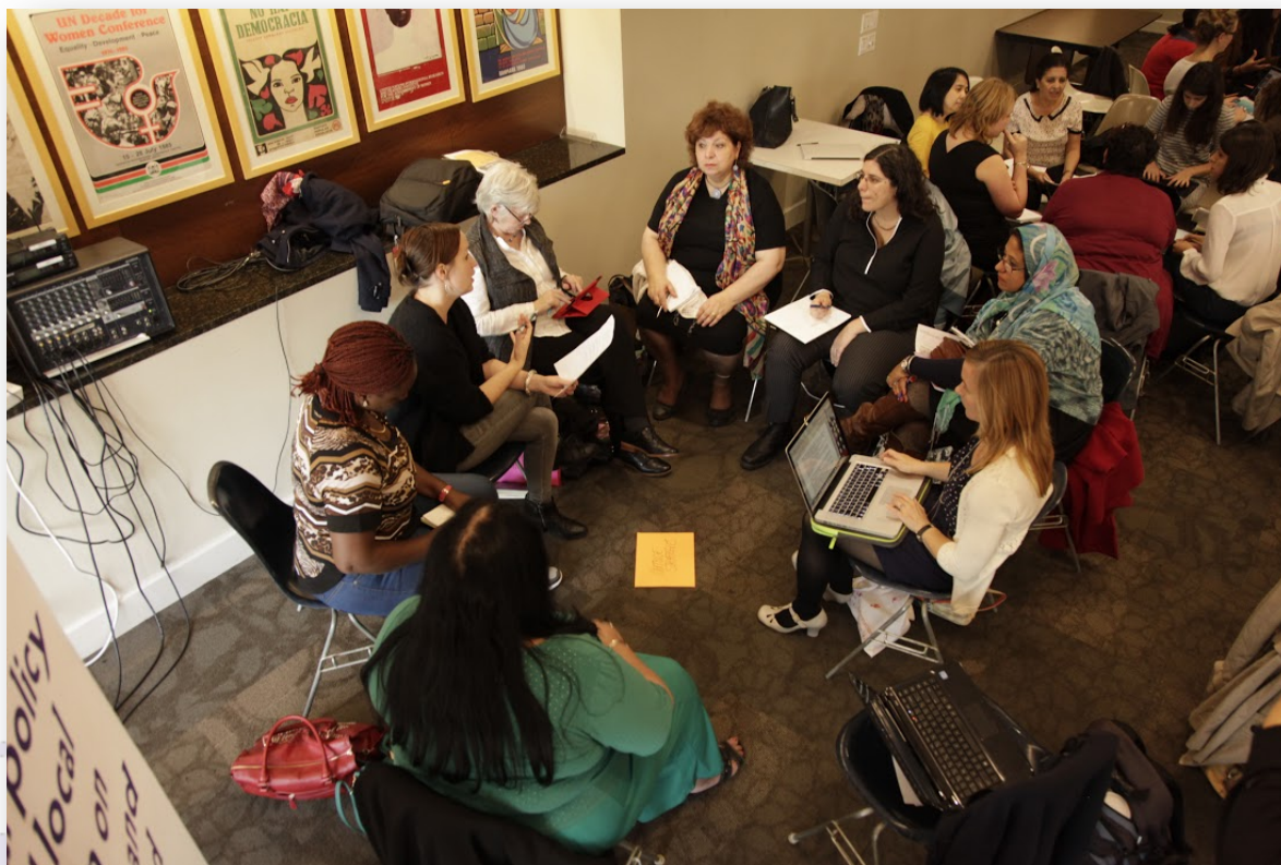
Audience Discussion from the Prelude to the Peace Forum

Peacebuilding, and Women, Peace and Security), Mahmoud recommended that moving forward on effective implementation requires strengthened action for an integrated approach across the UN system to: 1) prevent conflict (a key gap area) and promote sustainable peace, 2) speak to truth to power and more effectively engage men and governments for taking action, and 3) localise peace. “This is not a women’s issue,” he stated “it is a whole society effort for sustainable peace.”