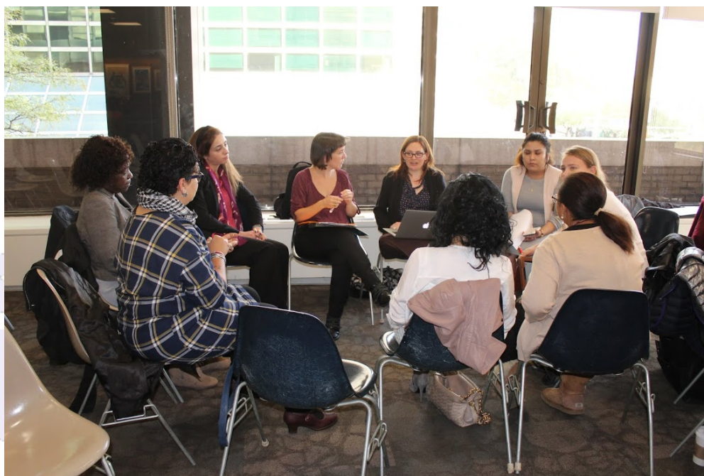
Side discussion from the Prelude to the Peace Forum