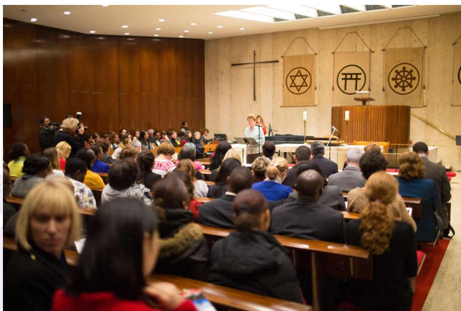
Open Panel of the Peace Forum

On 28-30 October 2015, WILPF, in collaboration with the Global Network of Women Peacebuilders (GNWP), Baha'i International Community, International Peace Bureau, United Methodist Women, the National Council of Negro Women, World Council of Churches, Peace Boat US, World Federation of Methodist and Uniting Church Women, APWAPS, Cordaid, Global Movement for the Culture of Peace, and Urgent Action Fund for Women's Human Rights held a Peace Forum at the Church Center of the United Nations. The Peace Forum created space to engage men and go beyond anniversaries in implementing the Women, Peace and Security Agenda.