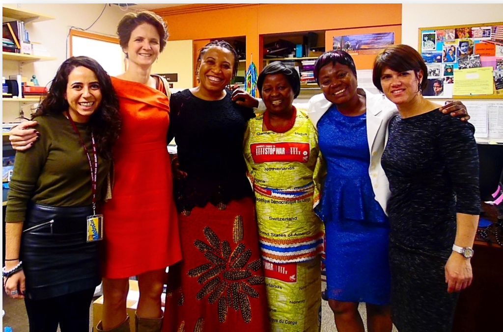
WILPF Delegation and Peace Women Team Members