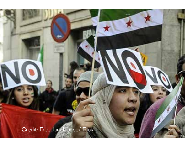
Young women with a placard reading "No" stuck on their forehead attending a demonstration against violence in Syria. Madrid, 2012.

sure women are ready and able to meaningfully participate in any peace negotiation process, and that they have a framework for a transitional model for justice and development that will help the State to move from conflict to sustainable peace. This specifically means addressing the trauma of war, including the trauma caused by sexualized violence, and gender based violence, a major feature of most post-war societies.