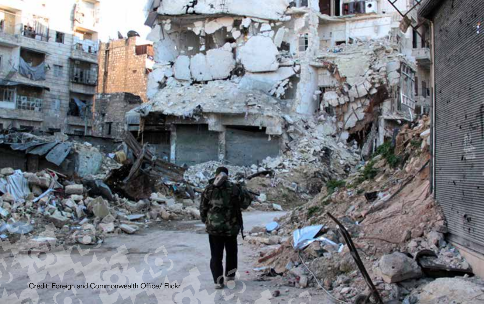
Aleppo, Karm al Jabal. Syria's infrastructure is destroyed beyond repair, so are the lives of many Syrian women, children and men. The infrastructure in the country is destroyed, the country is indebted, and most of the national and international resources are going to the armament.