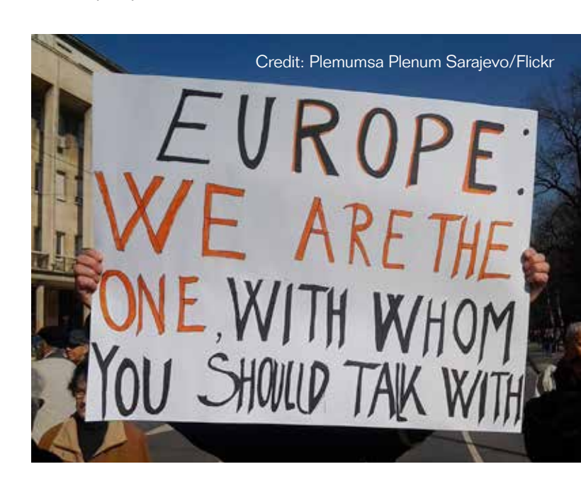
People of Bosnia sending message to the European Union and other international actors that they should be talking to the civil society and not to the nationalist. Protests in Sarajevo, February 2014.

prevention and peace building initiatives in Syria. The primary focus was on the experiences of the Bosnian and Syrian women. The Bosnian experience highlights what happens when women are not represented during peace talks, or in strategic decisions during the post-conflict recovery period, and how inefficient and discriminatory power embodied in patriarchal political elite continues to deepen conflicts in the society instead of solving them. At the same time, the on-going conflict in Syria and the Syrian women's struggle to gain meaningful space at the negotiations during the Geneva II Conference shed light on the inability of ground-breaking international mechanisms such as UNSCR 1325 to create a space for women when geopolitical interests and the interests of the male political elites are prioritized over the needs of Syrian people.