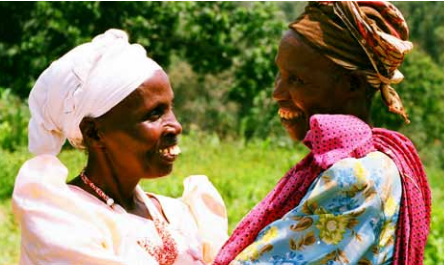
Two sisters greet each other in the fields on the way to the village market in Nyakasenyi, Uganda.