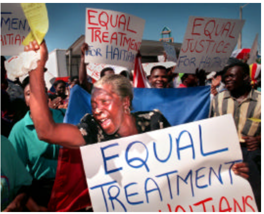
The Haitian-American community protests the treatment of Haitian asylum seekers.

First, ten days after the October boat arrival, the INS issued a notice authorizing the expedited removal of undocumented migrants who arrive by