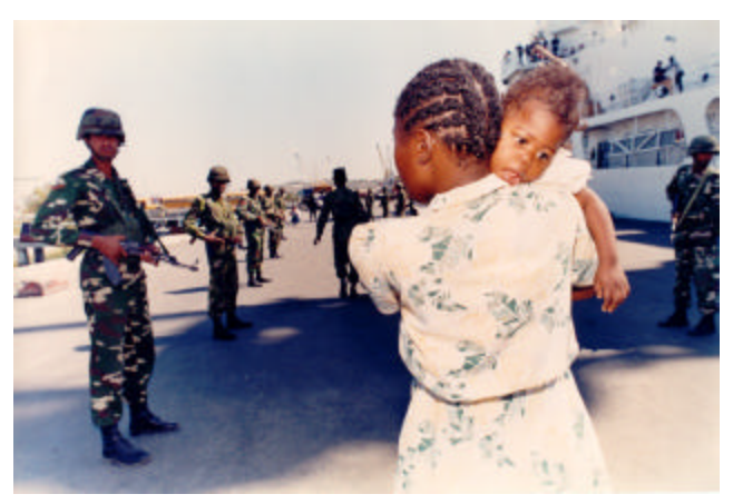
Thousands of Haitians were held at the Guantanamo Bay U.S. naval base on Cuba in the 1990s.

However, the Eleventh Circuit Court of Appeals and the U.S. Supreme Court both upheld the immediate returns to Haiti. The Eleventh Circuit ruled that the Haitians had no legally enforceable rights in the United States because they were outside U.S. territory. 70 Even prior to this decision by the circuit court, the Supreme Court responded to an emergency motion by the Administration arguing that it had evidence that 20,000 Haitians were massing on the shores of Haiti waiting to head to Guantanamo Bay. The Court issued a two-sentence order allowing the resumption of repatriations.<sup>71</sup> Attorneys for the Haitians questioned the Administration's assertion about the numbers and argued that Guantanamo was able to house more arrivals. Later, the Department of State admitted that it was unsure about the number of Haitians preparing to leave, and the Coast Guard concluded that there was no evidence of Haitians "massing." Moreover, U.S. officials later stated that Guantanamo could house an endless number of arrivals.72