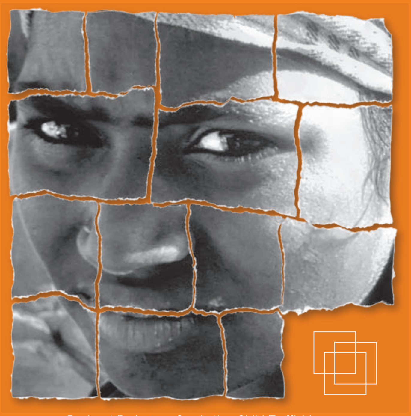
Regional Project on Combating Child Trafficking for Labour and Sexual Exploitation (TICSA-II)

Bangladesh, Nepal, Pakistan, Sri Lanka, Thailand & Indonesia