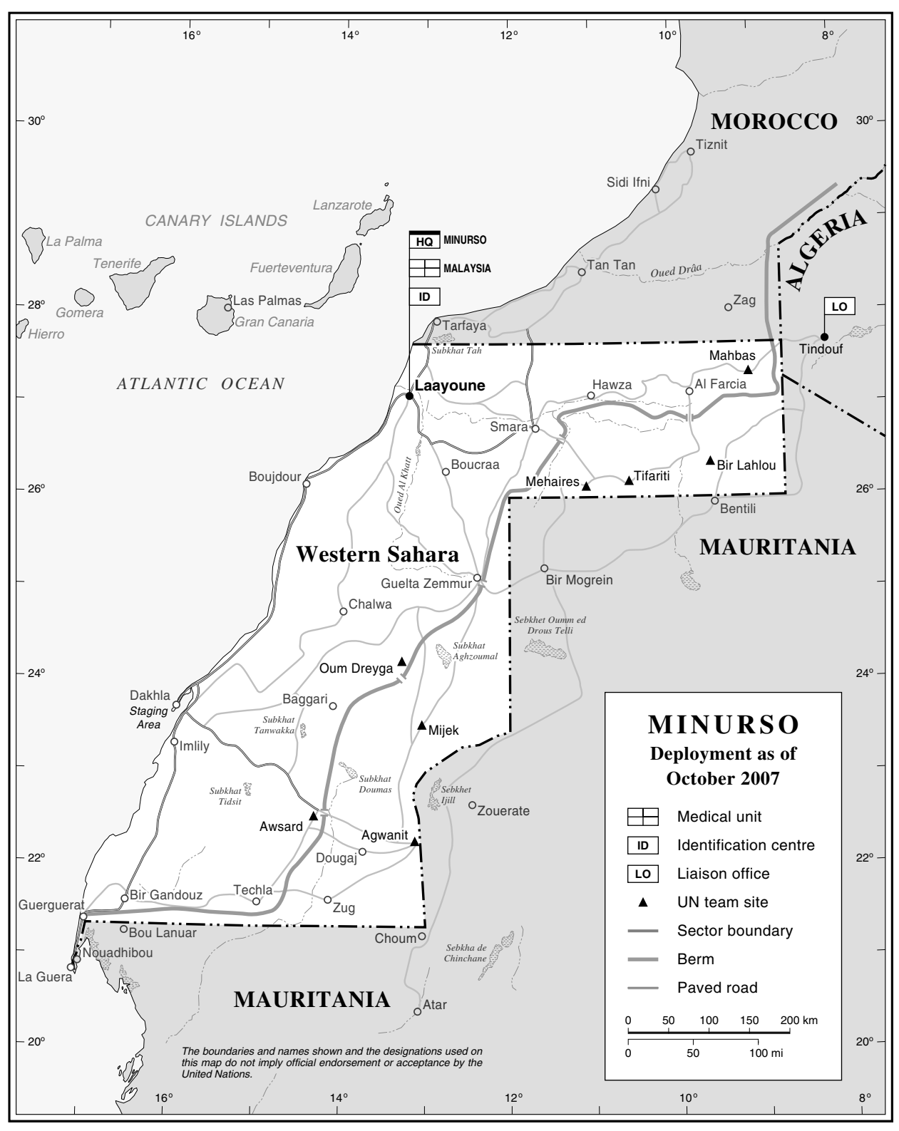
Map No. 3691 Rev. 55 UNITED NATIONS October 2007

Department of Field Support Cartographic Section