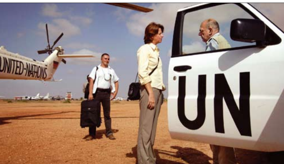
A UN representative in conversation with colleagues in the field. There are very few women in high-level positions in UN peace operations.