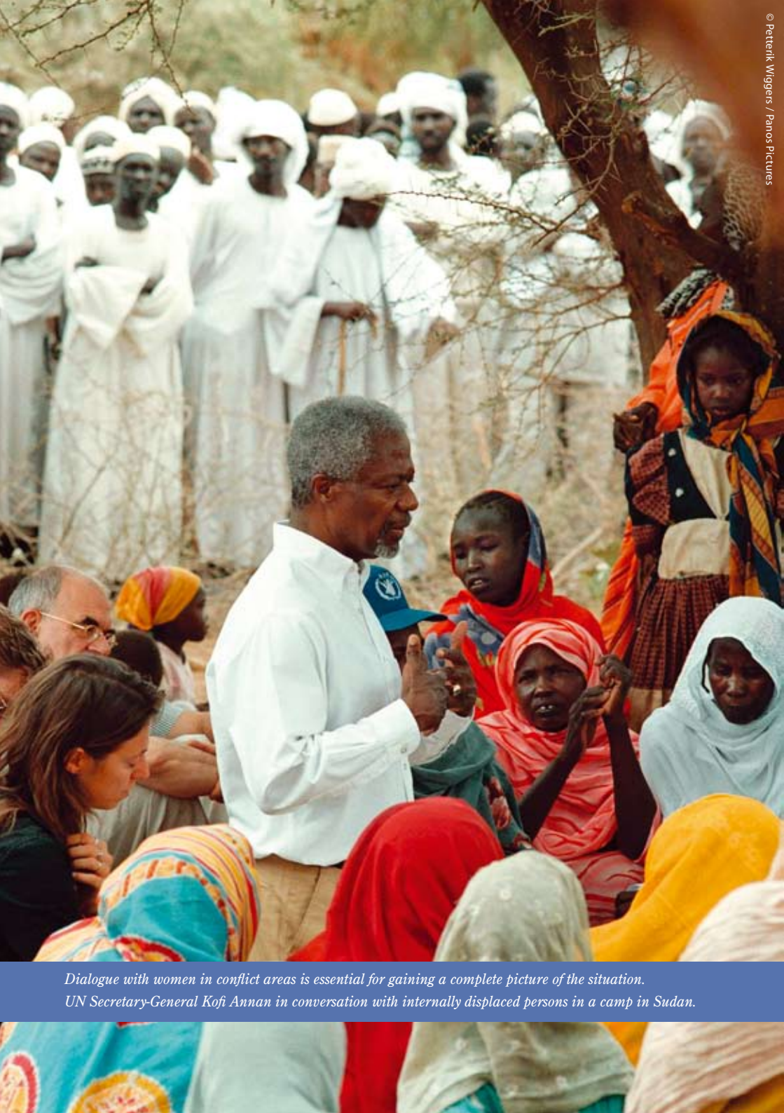
Dialogue with women in conflict areas is essential for gaining a complete picture of the situation. UN Secretary-General Kofi Annan in conversation with internally displaced persons in a camp in Sudan.

need for women police investigators who are trained to handle sensitive information about sexual abuse. There is also a need for personnel who have experience in investigating sexual abuse and gender-based violence in war and armed conflict.