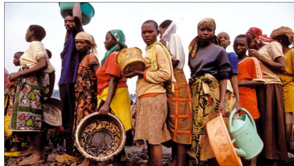
Women and children queuing for water. There is an urgent need to strengthen protection of refugees and internally displaced persons against abuse and violence.

against humanity. International implementation of the principle of “responsibility to protect” requires special efforts to combat gender-based and sexual violence. Norway will therefore combat impunity for international crimes such as rape and other forms of gender-based and sexual violence.