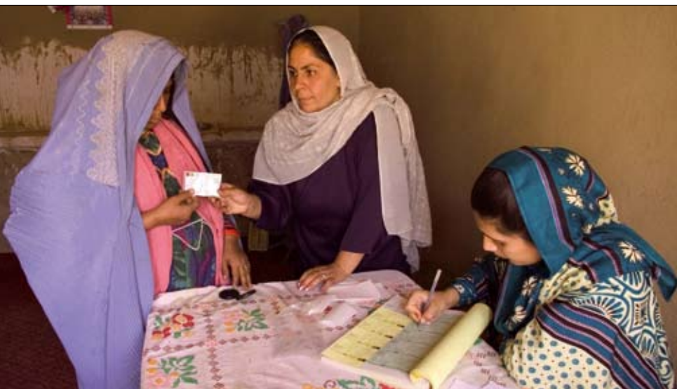
Voting in Afghanistan. Women's participation in political decision-making processes is an essential basis for democratic development.