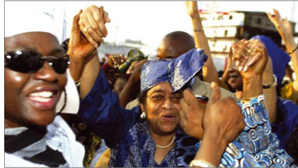
Ellen Johnson Sirleaf celebrates her victory in Liberia's presidential election in January 2006.

18. Decides to remain actively seized of the matter.