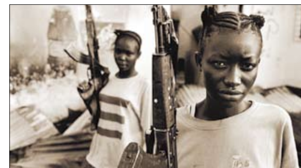
Left: Norway will help to strengthen and build up the judicial sector in countries undergoing post-conflict reconstruction. It is particularly important to ensure that women have access to the judicial system. Right: Combatants in Liberia. More and more women and girls are participating as combatants, either voluntarily or involuntarily.