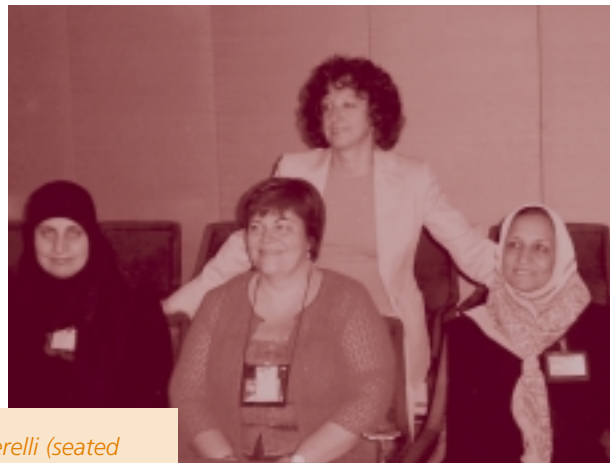
Carina Perelli (seated centre) with the two female Commissioners elected to the Electoral Management Body in Iraq (also seated).

One key aspect that is often overlooked in efforts to promote women's involvement is to provide for their participation in the institutions important to the electoral processes. Such is the case with the recently established Electoral Management Body in Iraq. The presence of women there is critical to ensure that women's needs and participation are addressed at all stages, and that the promotion of women takes root through national policies and practices.