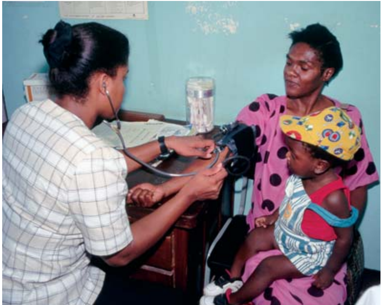
RIGHT: A health clinic in Jamaica. In the Caribbean, UNIFEM has worked to influence the public policy response to HIV/AIDS.

formulation and planning. In addition, UNIFEM commissioned a gender evaluation of the National Strategic Plans on HIV/AIDS of several Caribbean countries, which pointed out shortcomings and recommended that gender experts provide assistance in reviewing these plans. To date, five National AIDS Committees have signed on to strengthening their National Strategic Plans by engaging gender experts; another five countries have committed to supporting the gender mainstreaming process.