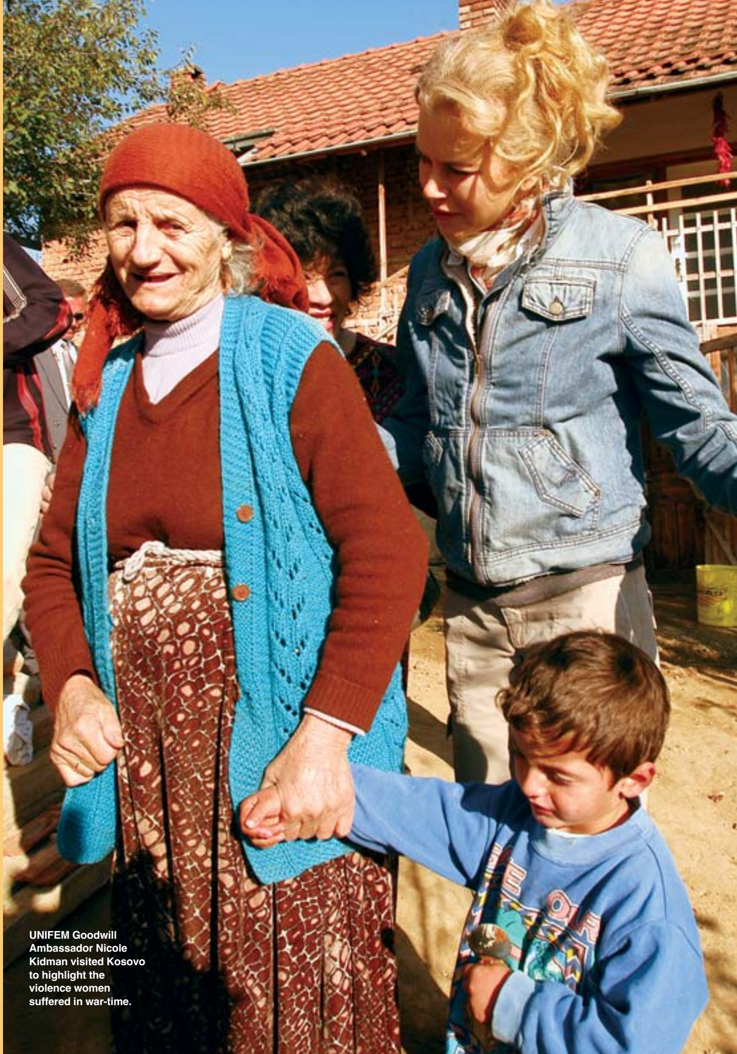
UNIFEM Goodwill Ambassador Nicole Kidman visited Kosovo to highlight the violence women suffered in war-time.