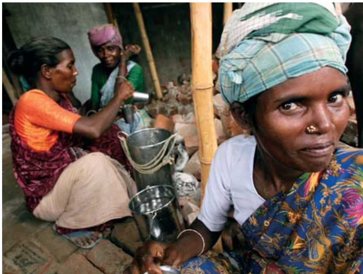
RIGHT: In India and other countries, women look to UNIFEM to put their needs on the UN agenda.