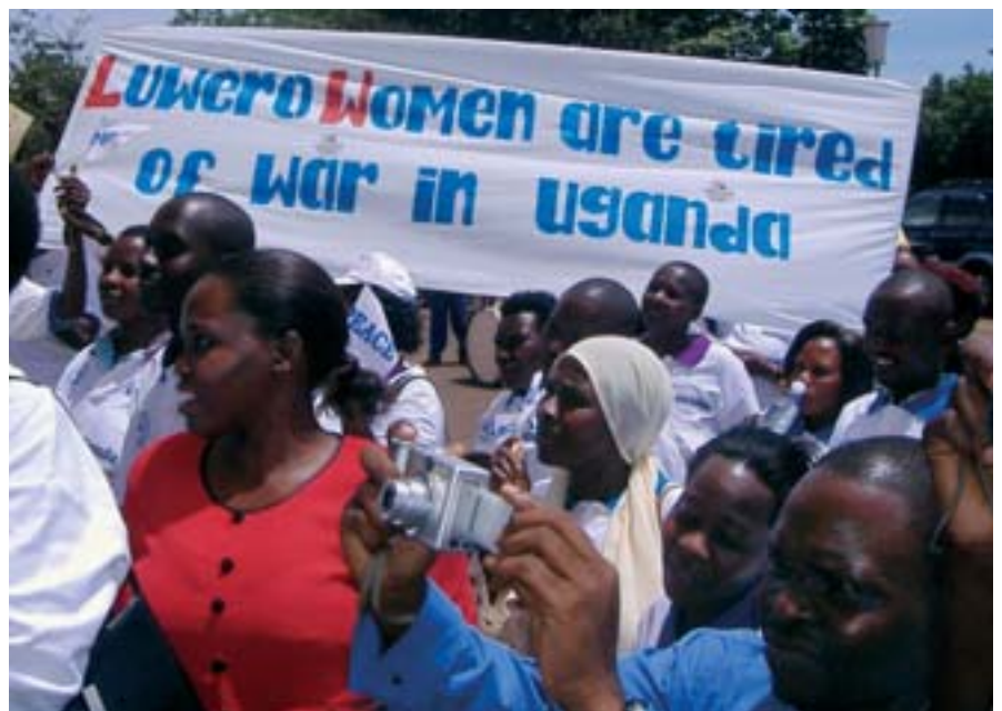
ABOVE: From peace caravan to peace treaty: Ugandan women travelled to Juba, Sudan, demanding peace and the inclusion of women in the treaty-negotiation process.

■ To advance the role and number of women in political and public life, UNIFEM helped to establish the first virtual network linking women in politics ( www.iKNOWPolitics.org ). Drawing on a database of over 100 experts on women in politics, the International Network of Women in Politics allows users to directly field queries and to access an online library with materials from leading international institutions.