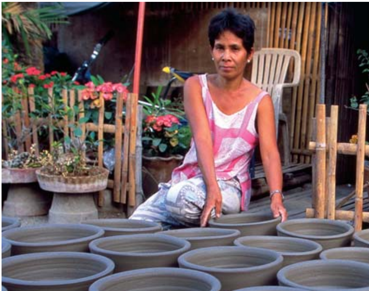
RIGHT: Moulding the future of home-based workers: Improving conditions in the informal sector has been a focus for UNIFEM in Asia.

Improving working conditions in the informal sector has been a focus for UNIFEM, particularly in Asia. In 2006, support in this area resulted in the submission of a bill to strengthen protection for workers in the informal economy in the Philippines. In addition, the Action Plan adopted at a regional conference for South Asia jointly organized with the Self Employed Women's Association (SEWA) calls on countries to ratify International Labour Organization (ILO) Convention 177, also called the Home Work Convention, collect data on home-based workers and increase their trading opportunities.