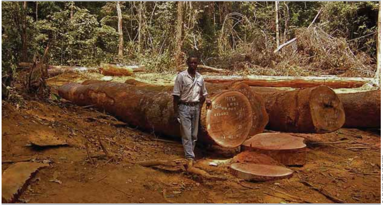
Ensuring that concessions and licenses for commercial mining and forestry operations are granted in a fair and transparent manner that yields benefits for local communities and the economy is a major challenge in peacebuilding

In addition, the Regional Certification Mechanism (RCM) adopted by the International Conference of the Great Lakes Region (ICGLR) in Africa, which covers major conflict minerals, has included women, peace and security considerations insofar as to recognize the high levels of rape and other sexual violence towards women around militarized mining areas.<sup>105</sup> At an implementation level, the RCM identifies the need for: consultations with women's groups; strategies for the improvement of the conditions of women working in the mine's area of influence; and guaranteed protection of fundamental women's rights. These are listed as "progress criteria" for certification applicable to both artisanal and industrial mining. However, these criteria are currently only monitored for the purposes of certification, with the view that ICGLR Member States implementing the RCM will one day develop and/or demonstrate the will and capacity to enforce such criteria and shut down mines and/or exporters when these criteria are not met.