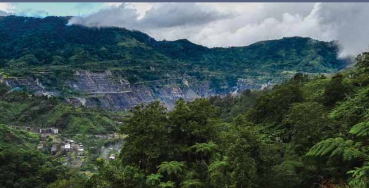
Women in Bougainville, PNG, spearheaded peace talks to end the bloody civil conflict that erupted over environmental contamination and the lack of equitable benefit-sharing from the Panguna copper mine

From 1988 to 1999, the province of Bougainville, Papua New Guinea (PNG), was center stage for one of the bloodiest conflicts in the South Pacific since the end of World War II.<sup>106</sup> While a range of underlying drivers can be linked to the conflict, disputes over the distribution of costs and benefits from a large-scale mining project were central to the eruption of violence in the region. Revenues from the Panguna Mine, the world's largest open-pit copper and gold mine at the time, comprised the single largest source of income for the central government of PNG and brought enormous profits to Rio Tinto, the British-Australian company that owned it.<sup>107</sup> Not all benefited from the Panguna Mine, however, as its operations caused significant social and environmental damage to local communities.<sup>108</sup>