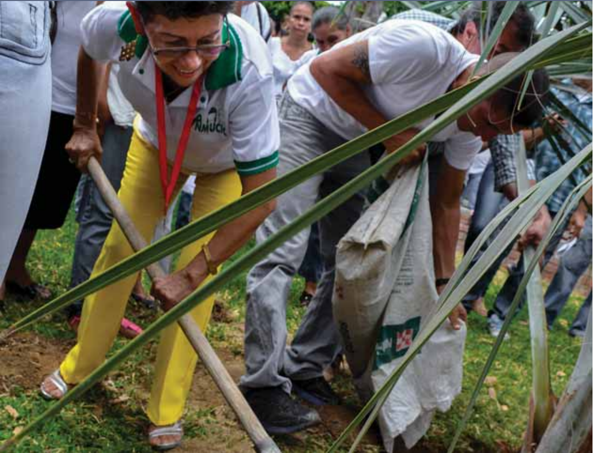
Members of the National Association of Rural, Afrocolombian and Indigenous Women of Colombia mark the beginning of a collective reparations process under the Victims and Land Restitution Act, which represents an important opportunity for returning land that was unlawfully taken during the conflict

In June 2011, Colombia ratified a Victims and Land Restitution Law (Law 1448/11) facilitating the restitution of land that was stolen or lost as a result of displacement during the conflict. Additionally, the law provides reparations for victims of conflict-related human rights abuses.<sup>199</sup> Under the new law, the members of ANMUCIC are eligible for collective reparations for being dispossessed of their land, as well as for the threats, killings and forced displacement that they endured. With support from the Colombian Special Administrative Unit for the Attention and Comprehensive Reparation of Victims and the Norwegian Refugee Council, the Association has been able to make progress on the identification of damages it has suffered as a result of the conflict.<sup>200</sup> Ensuring that the ANMUCIC women are successful in claiming reparations that sufficiently reflect the damage they suffered in terms of violence and lost livelihood opportunities would be an important benchmark for enforcing the rights guaranteed by the new law to the most vulnerable groups. If successful in accessing reparations for its members, the case of ANMUCIC in Norte de Santander could provide a positive legal precedent for other groups of women in similar situations.<sup>201</sup>