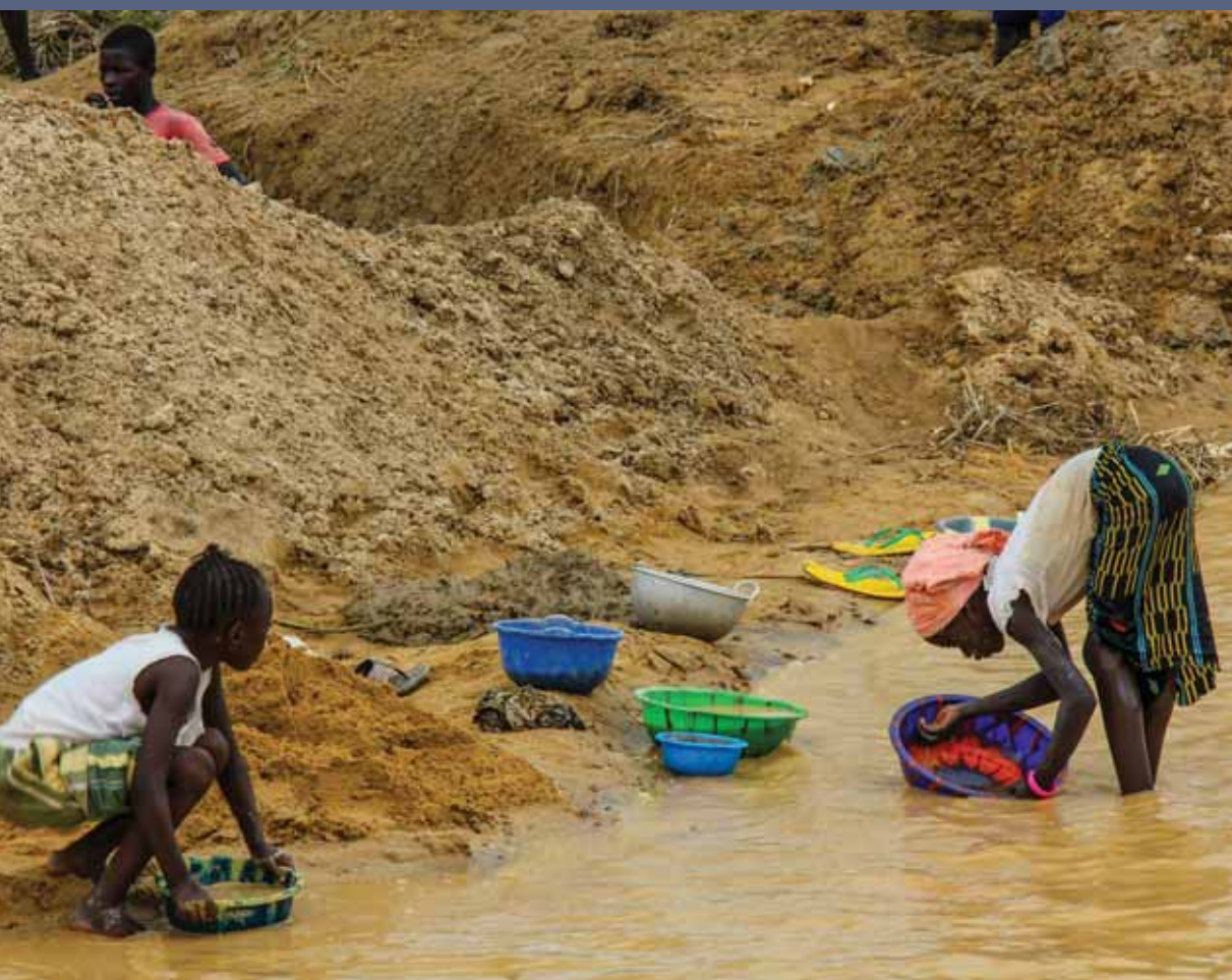
To supplement their income, many women in Sierra Leone have sought alternative opportunities as informal traders or artisanal miners. In 2008, it was estimated that in some areas up to 90 per cent of small-scale alluvial gold prospectors were women

Revisiting existing land tenure legislation such as the Devolution of Estates Act (2007)<sup>127</sup> will be necessary to enhancing protection for rural women working on family or chieftaincy-governed land, and improving women's empowerment in both agriculture and artisanal mining.