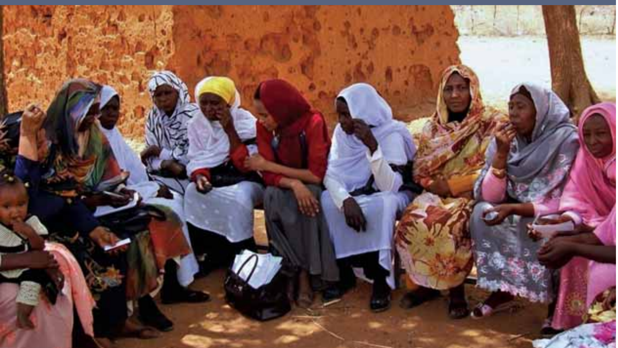
Engaging women in natural resource management could help foster more inclusive decision-making processes in South Kordofan, Sudan, where women pastoralists have been recognized as being particularly influential in managing conflict

Conflict in Sudan has spanned almost 50 years. Although the establishment of the Republic of South Sudan on 9 July 2011 officially marked the final stage of a six-year peace agreement, many critical issues remain unresolved.<sup>154</sup> Decades of violent civil war followed by a fragile peace have disrupted traditional conflict resolution mechanisms and left numerous localized conflicts unsettled.