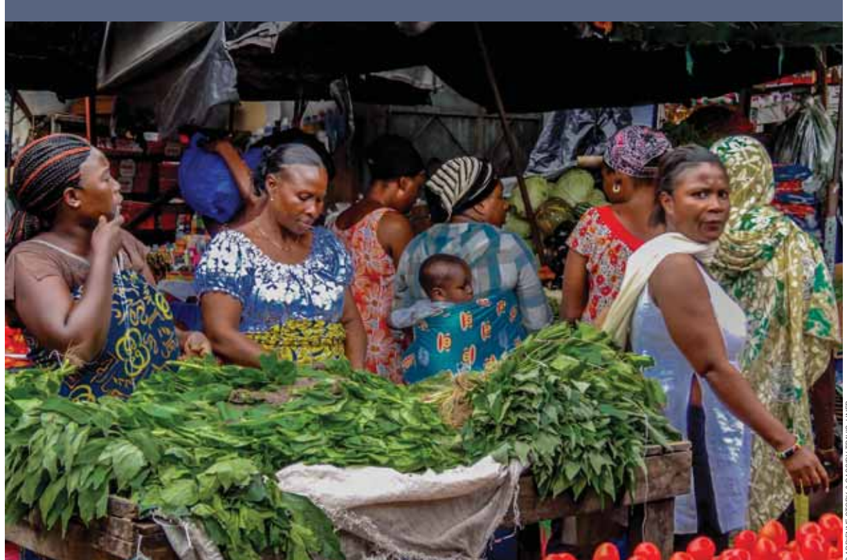
Despite the key role they play in food production and marketing, as seen here in Treichville, Abidjan, female farmers in Côte d'Ivoire rarely use microcredit schemes or government subsidies due to their limited access to technical training and inputs

The civil conflict that plagued Côte d'Ivoire between 2002 and 2011 is rooted in a mix of highly politicized land pressures and ethnic tensions. Open door immigration policies intended to encourage growth in key export sectors (mostly cocoa and coffee) led to the influx of migrants in the 1960s and 1970s, setting the stage for subsequent land conflicts between self-identified indigenous groups and those originating from the wider West African region. At the peak of the electoral crisis in 2011, approximately one million people were internally displaced and 200,000 lvoirian refugees had fled the country.<sup>202</sup> Since the end of this crisis in April 2011, large numbers of land disputes – at times violent – have occurred, often exacerbated by the return of refugees and internally displaced people.