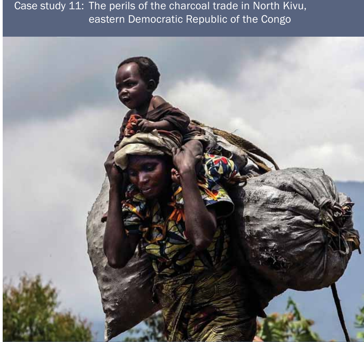
Charcoal remains the primary source of household energy in the province of North Kivu, the area at the heart of the protracted conflict in DRC. Making charcoal in the often remote forest exposes women to the risk of sexual violence

The role of extractive resources (including high-value minerals) in the protracted conflict in the eastern Democratic Republic of the Congo (DRC) has been well documented.<sup>172</sup> However, renewable natural resources, such as land, water, timber and non-timber forest products, also play a pivotal role in the local economy and livelihoods – particularly for women, who gather and transform these resources for household use and sale in local markets.