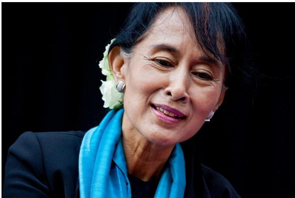
Nobel laureate Aung San Suu Kyi finally visiting Oslo, 21 years after being awarded the prize.

21 years after being awarded the Nobel Peace Prize in 1991, Aung San Suu Kyi finally delivered her much-awaited Nobel Lecture in the Oslo City Hall on Saturday 16 June. In a ceremony resembling a ‘proper’ Nobel award ceremony she gave a lecture that touched all those present in the City Hall and all those watching the broadcast of the event. In her lecture she spoke about how improbable it seemed to her to ever be awarded the Nobel Peace Prize. She spoke about how important the Nobel Peace Prize had been during her days and years in house arrest to remind her that she was still part of a wider human community. More importantly, she emphasized how the Nobel Prize had drawn the attention of the world to the struggle for democracy and human rights in Burma, reminding her that “We were not going to be forgotten”. The importance for human beings, and particularly refugees, of not being forgotten was a key theme in her speech, along with her undying passion for democratic governance and human rights as instruments for ending human suffering and creating lasting peace.