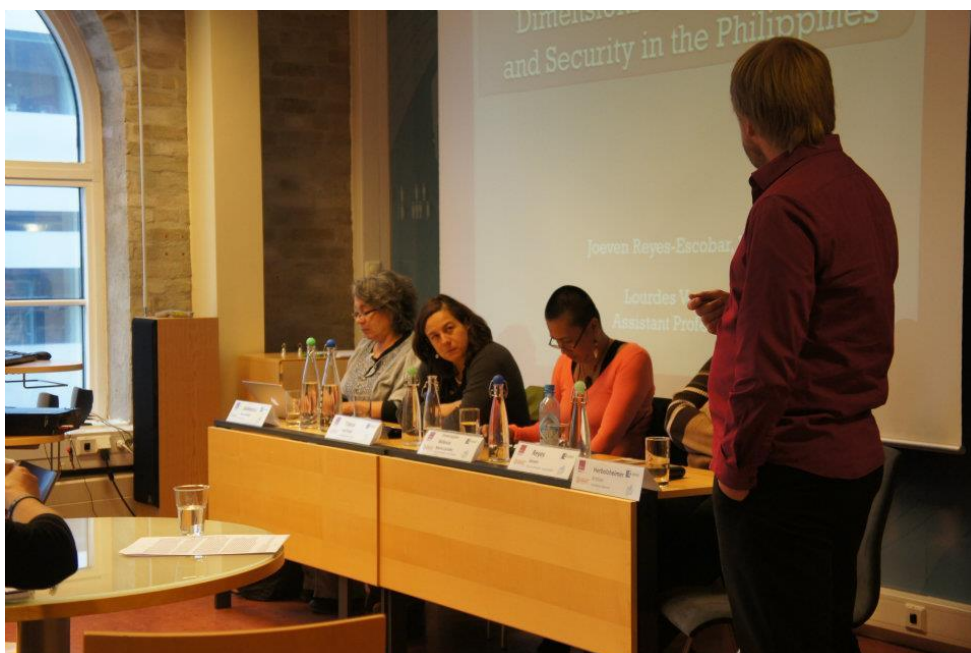
Participants at the Conciliation Resources event at PRIO.

The guidelines are designed to assist mediators in how to include references to conflict-related sexual violence in ceasefire and peace agreements. Torry stated that it is important that these