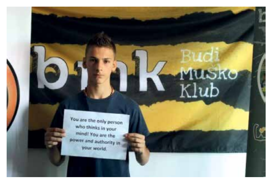
Be a Man Club, by the Young Men's Initiative.