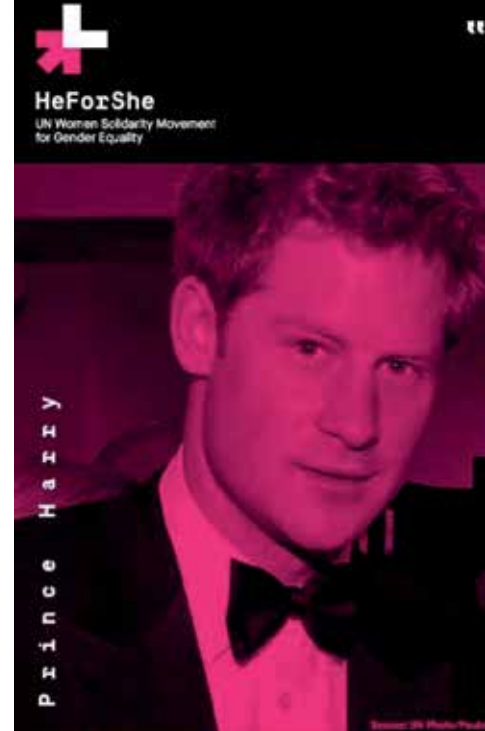
"This is not just about women, we men need to recognize the part we play, too.

The various strains of "engagement work" endeavour to express the goals of gender equality in a way that resonates with men's own experiences, to promote alternative role models or attitudes, and to try to market gender equality as something that benefits men. It is helpful to distinguish what this paper deems "engagement work", which are clusters of programme-led efforts to change the attitudes of men who are not already engaged in feminist politics, from the long and complicated history of men's collective action within the feminist paradigm. Each of these strains has historical roots within the attempts by groups of men