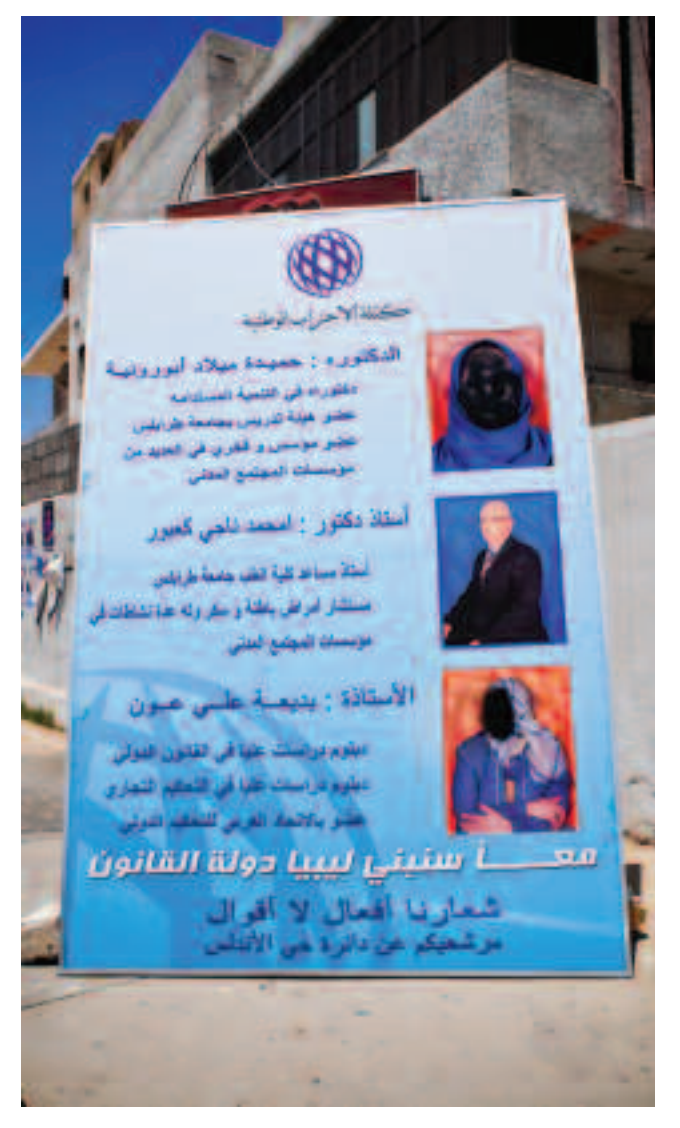
A vandalized election poster in Tripoli with the defaced photos of two female candidates. Human Rights Watch documented more than a dozen instances of vandalism against the election posters of female candidates. Vandals tore down posters of female candidates or slashed and spray painted their faces while usually leaving those of male candidates intact.

violence against women.<sup>54</sup> The CEDAW Committee declared in its General Recommendations 28 and 19 that violence against women amounts to a form of discrimination and said that states have a due diligence obligation to prevent, investigate, prosecute, and punish acts of gender-based violence.<sup>55</sup>